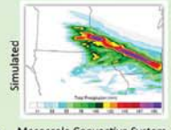
Mesoscale Convective System