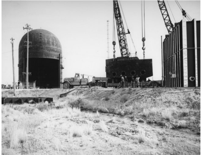
LOFT reactor under construction, 1969.

building. The intensely radioactive fuel would then continue on its downward path into the ground. This scenario became known as the “China syndrome,” because the melted core would presumably head through the Earth toward China. Other possible dangers of a core meltdown were that the molten fuel would breach containment either by reacting with water to cause a steam explosion or by releasing elements that could then combine to cause a chemical explosion. The precise effects of a large core meltdown were uncertain, but it was clear that the effects of radioactivity spewing into the atmosphere could be disastrous. ACRS and the regulatory staff regarded the chances of such an accident as low; they believed that it would occur only if the emergency core cooling system (ECCS), made up of redundant equipment that would rapidly feed water into the core, failed to function properly. However, they acknowledged the possibility that the ECCS might not work as designed. Without containment as a fail-safe final line of defense against any conceivable accident, they sought other means to provide safeguards against the China syndrome.