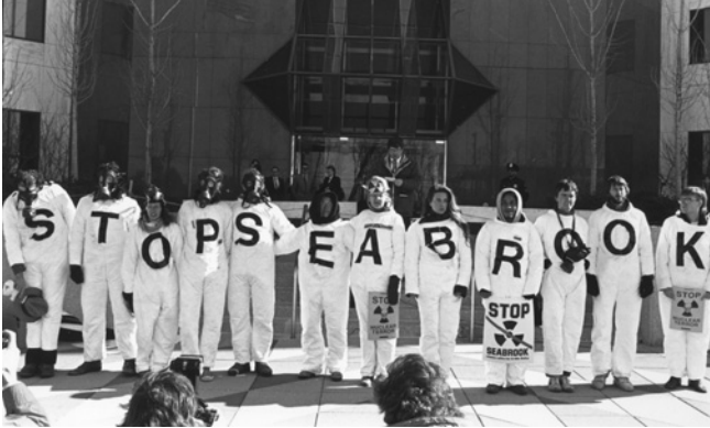
Opponents of a full-power license for Seabrook express their views at NRC headquarters in Rockville, Maryland, 1990.

and Massachusetts sought to do in the cases of Shoreham and Seabrook. In New York, Governor Mario M. Cuomo and other state officials claimed that it would be impossible to evacuate Long Island if Shoreham suffered a major accident. Although plant proponents pointed out that emergency plans did not require the evacuation of all of Long Island if a serious accident occurred, the State refused to join in emergency planning procedures or drills. The NRC granted Shoreham a low-power operating license, but the State and the utility, Long Island Lighting Company, eventually reached a settlement in which the company agreed not to operate the plant in return for concessions from the State.