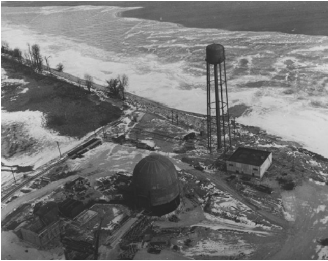
PRDC reactor under construction, 1958.

fast breeder reactor, despite the reservations of ACRS, ignited an acrimonious controversy with the Joint Committee and raised questions about the AEC's regulatory program. In January 1956, the Power Reactor Development Company (PRDC), a consortium of utilities led by Detroit Edison Company, applied for a permit to build a fast breeder reactor in Lagoona Beach, MI, located on Lake Erie within 30 miles of both Detroit, MI, and Toledo, OH. The AEC had already received applications for two privately financed reactors, but the PRDC proposal was the first to come in under the power demonstration program.