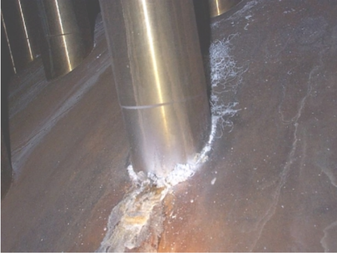
Figure 1-3 Leaking CRDM Nozzle at Oconee 3