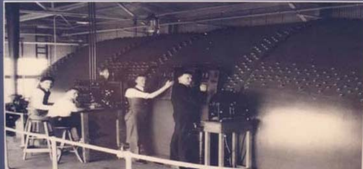
Engineers peered through one who occurred there, so that a tabulated, analyzed and trac

The test results more nearly correlated with a full-sized aircraft in flight – for the first time in the history of aeronautics research.