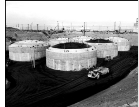
Support Defense Complex Clean-Up