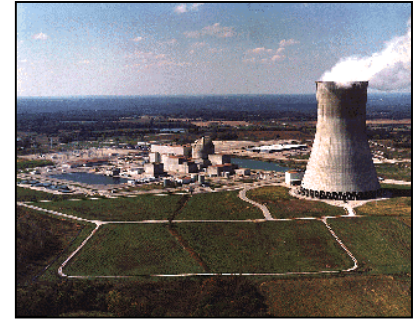
Support Commercial Nuclear Energy Option