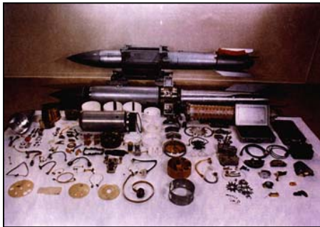
Support Surplus Weapons Material Disposition