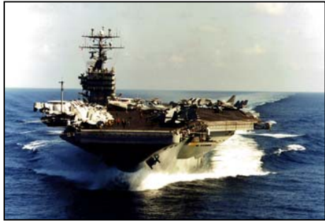
Support Nuclear Navy Mission