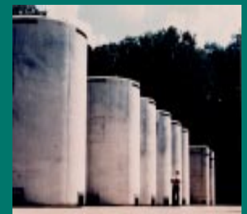
Dry Cask Storage