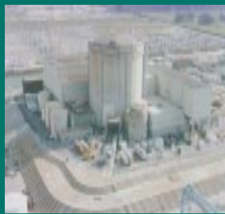
Commercial Power Reactors