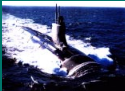
Naval Propulsion Reactor