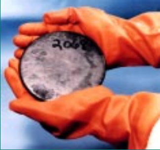
Surplus Weapons Fissile Materials