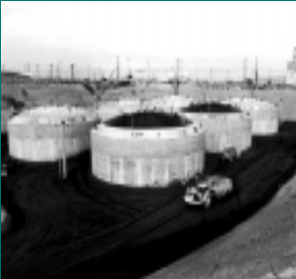
Defense Complex Clean-Up