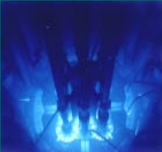
DOE and Foreign Research Reactors