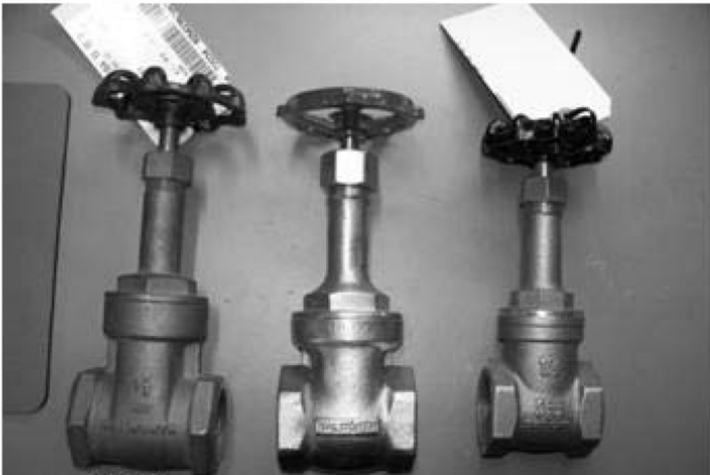
Figure 1: Example of authentic versus counterfeit components

An example of a counterfeit Walworth gate valve (center) is much like the other two authentic valves, but did not meet product specifications.