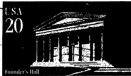
Founder's Hall Girard College, Philadelphia, PA 1848-1998

Secretary U.S. Nuclear Regulatory Agency Washington D.C. 20555