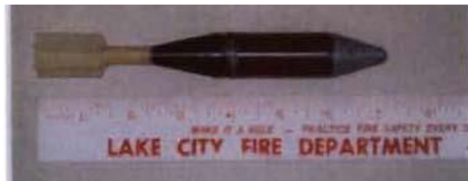
Figure 1-1 Davy Crockett M101 spotting round

Requirements of this plan are in addition to, not in lieu of, all other safety requirements, especially those related to unexploded ordnance (UXO) in or around RCAs.