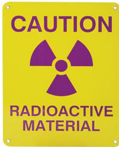
Figure 14-1 "CAUTION, RADIOACTIVE MATERIAL" sign