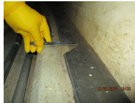
Azimuth 215: 3"x 2" (Moisture barrier exposed no damage seen)