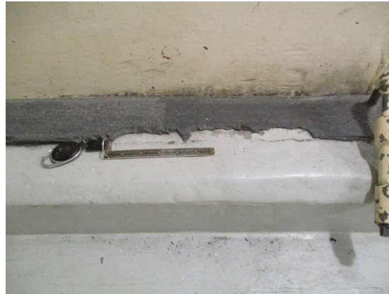
Azimuth 79: 1" x 12" Moisture barrier not exposed