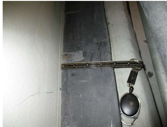
Azimuth 285: 1" x 2"