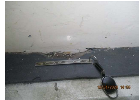
Azimuth 207: 6"x 1.4"