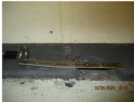
Azimuth 180: 3"x1.8"