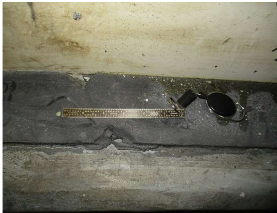
Azimuth 35: 2- 1" x 1" triangles