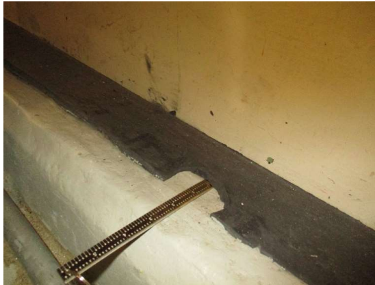
Azimuth 135: 3" x 1 ½" Moisture barrier not exposed