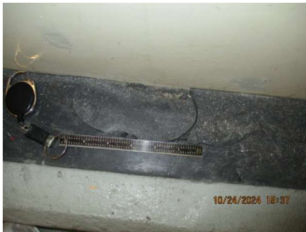
Azimuth 327: 5"x2.6"