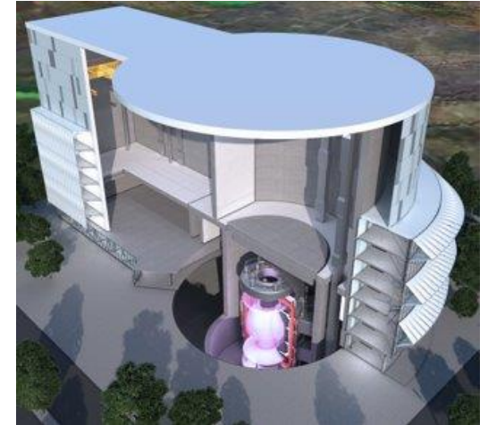
Illustration of STEP prototype power plant facility.