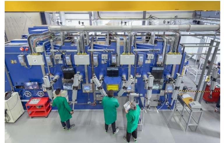
UKAEA's Materials Research Facility (MRF) prepares and examines samples of radioactive materials to assess their performance