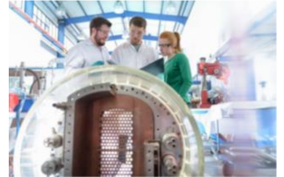
Illustration of UKAEA fusion scientists and engineers. © UKAEA