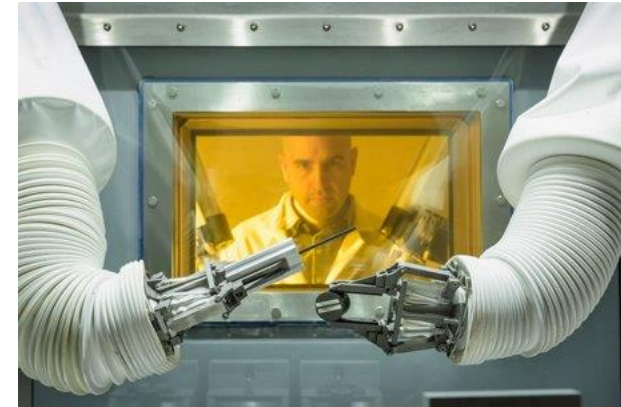
Representation of UKAEA working with hazardous material