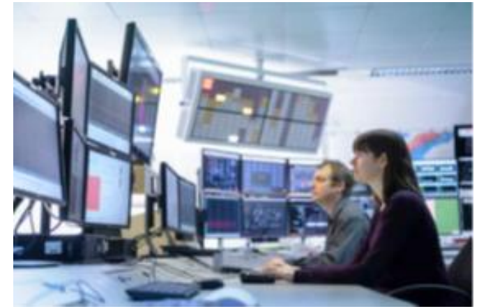
Illustration of UKAEA fusion scientists and engineers.

https://scientific-publications.ukaea.uk/wp-content/uploads/UKAEA-RE2101-Fusion-Technology-Report-Issue-1.pdf