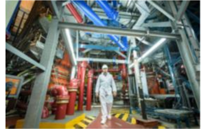
View of the Joint European Torus (JET) facility