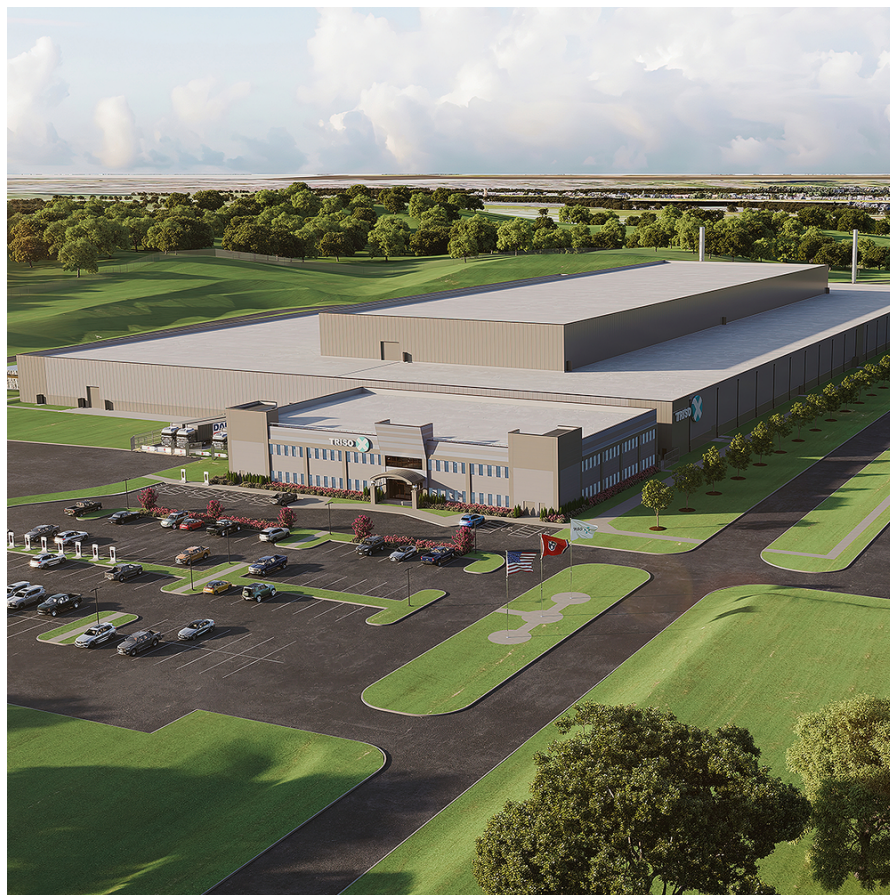
Video: TRISO-X Fuel Fabrication Facility

"Today's groundbreaking by X-energy is further proof that Oak Ridge is the center of America's revived domestic nuclear energy industry. I am proud that X-energy has chosen Oak Ridge to build its new TRISO manufacturing facility and invest in Oak Ridge's outstanding workforce," added U.S. Representative Chuck Fleischmann.