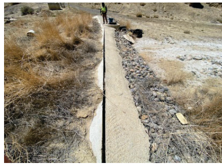
Concrete Drop Structure