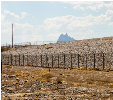
Shiprock Disposal Site