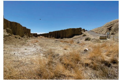
Many Devils Wash Upstream View

Why is the U.S. Department of Energy removing infrastructure at the former processing site?