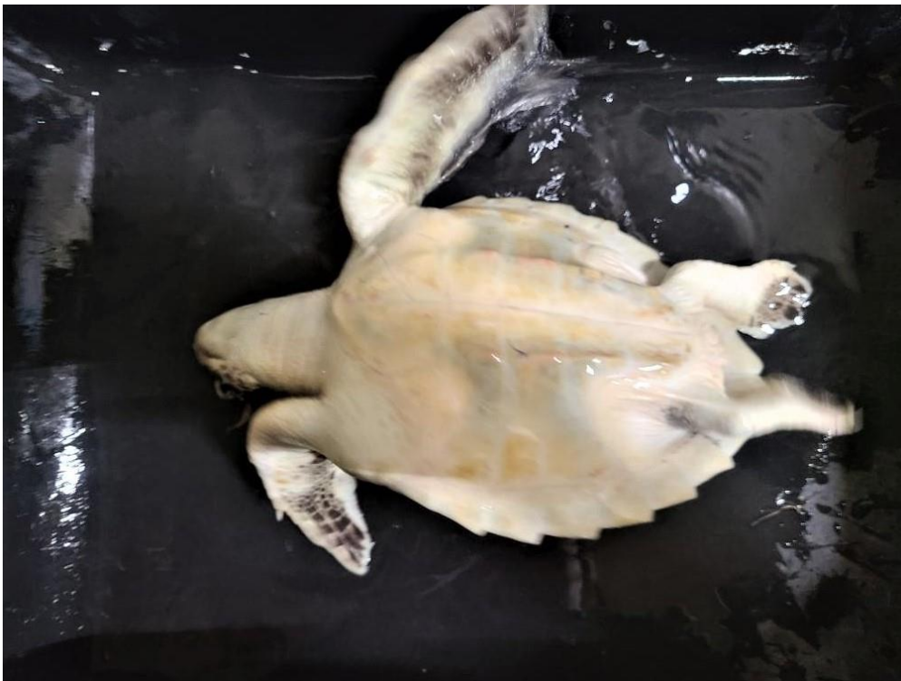
A ventral view of the specimen, showing the condition of the plastron (09/23/2022).