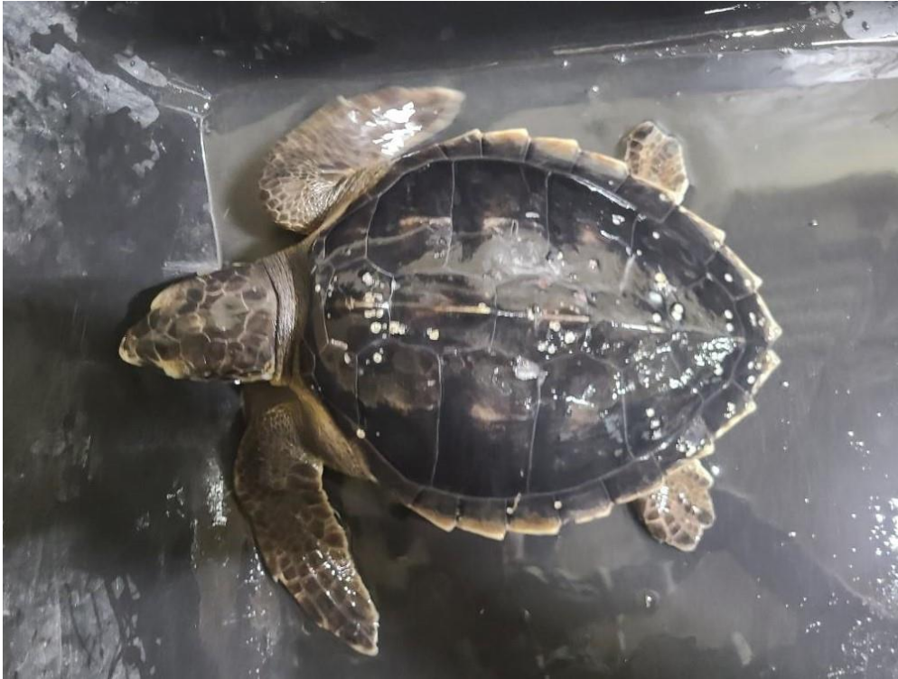
Dorsal view of a live, Kemp's ridley sea turtle, collected from Salem CWIS intake on 09-23-2022 by Salem Yard crew, with assistance from ECSI on-site personnel. Specimen was in excellent condition, with no indication of injury (09/23/2022).