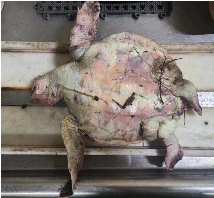
A ventral view of the specimen, showing the condition of the plastron. Except for some bruising on the plastron and flippers, no obvious signs of injury or damage was observed (09/22/2022).