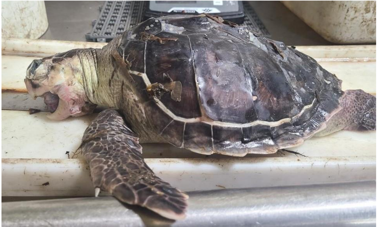
A dorsolateral view of specimen, showing the effects of the early stages of decomposition, indicated by swelling of the eyes, tongue, and tissue in the vicinity of the head and neck, as well as peeling of the outer layer of the scutes on the carapace (09/22/2022).