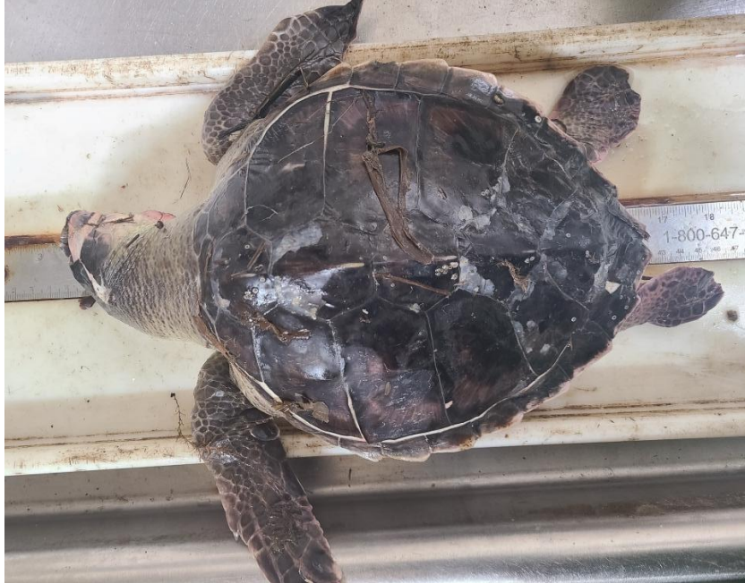
Dorsal view of a deceased Kemp's ridley sea turtle, collected from Salem CWIS intake on 09-22-2022 by Salem Yard crew personnel. Specimen was not severely damaged, but revealed signs of the onset of early decomposition (09/22/2022).