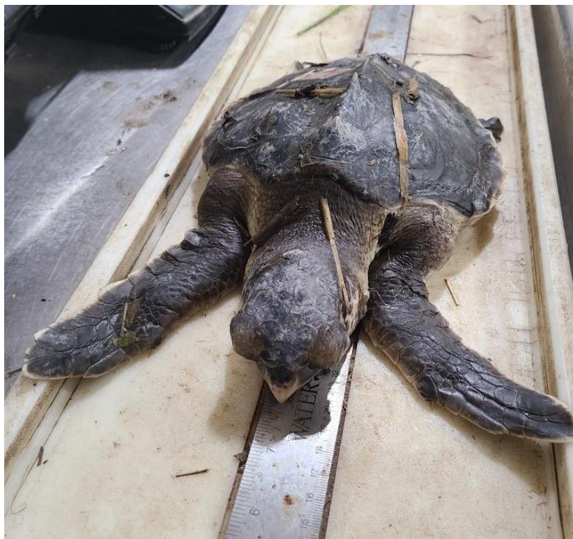
An anterior view, providing an additional example of the condition of the specimen as it appeared at the time of initial collection and processing (07/06/2022).