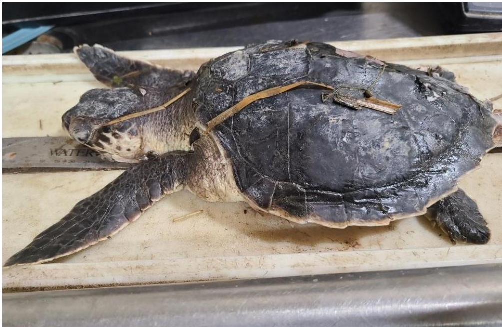
A dorsolateral view of the left side, showing the condition of the carapace (07/06/2022).