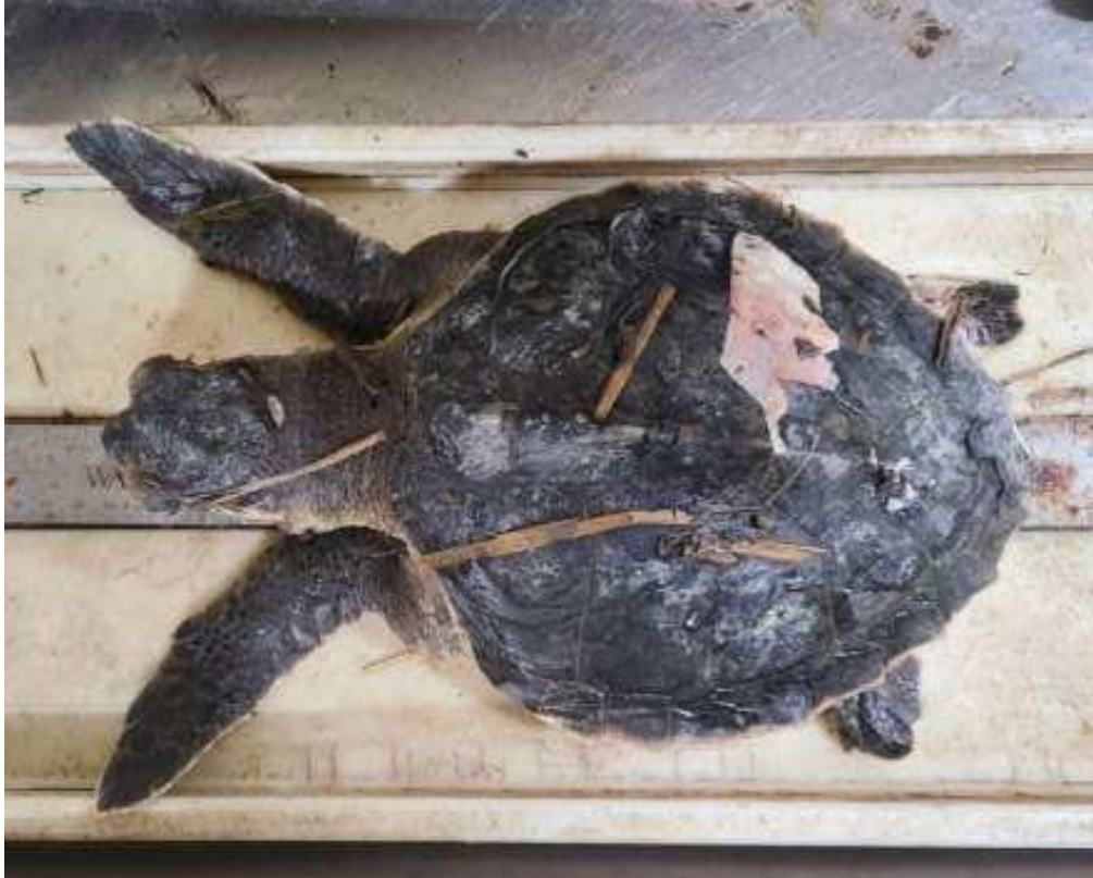
Dorsal view of a deceased Kemp's ridley sea turtle, as it appeared after retrieval from Salem CWIS intake on 07-06-2022 by Salem Yard crew personnel. Minor damage is shown to the lower costal scutes on the carapace (07/06/2022).