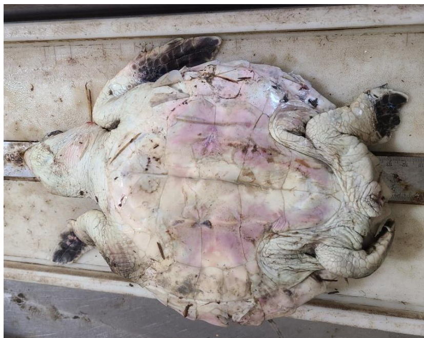
Ventral view showing the condition of the plastron, which shows some evidence of minor bruising (07/06/2022).