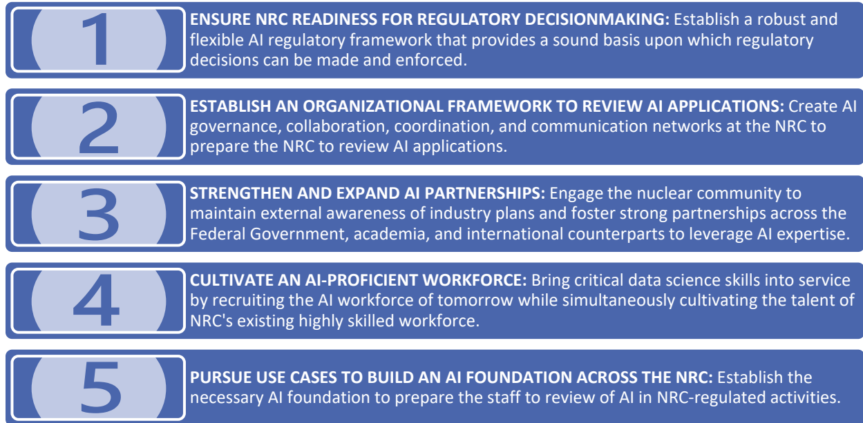
Figure 2 Overview of Strategic Goals

The AI Strategic Plan sets out the five strategic goals shown in Figure 2 to ensure readiness for reviewing the use of AI in NRC-regulated activities.