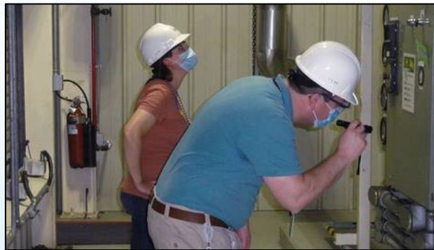
Safe and secure use of Radioactive Materials