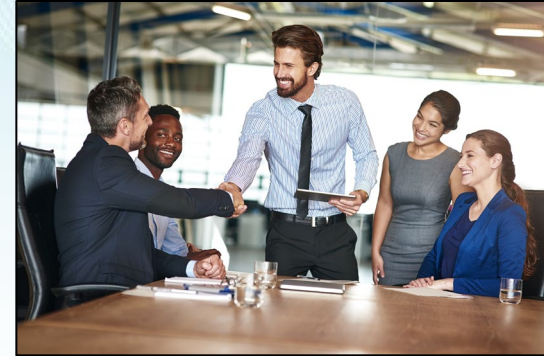
Continuing to foster a healthy organization