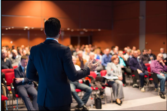
Inspiring stakeholder confidence in the NRC