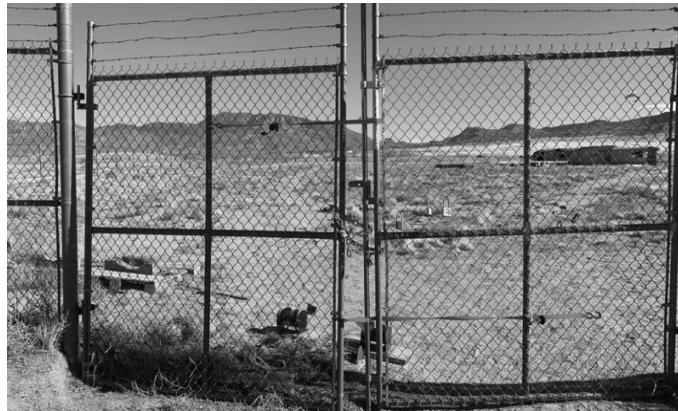
Figure 2: Training Site 3 Fence (Post - Corrective Action)

5. Corrective Action: The TS-3 gate has been secured with a second chain and lock plus two ratchet straps. The additional chain and straps have secured the gate so that a person is not able to gain access. Bioenvironmental is updating the OT-10 access OI to accurately reflect the current approved procedures. The Permit RSO has submitted a work order (#M-5236) with the 377th Civil Engineering Squadron to have the gate replaced. In addition, BE have added monthly physical security checks to their standard operating procedures. The checks include all six gates, plus walking the fence line to ensure integrity of the secure area.