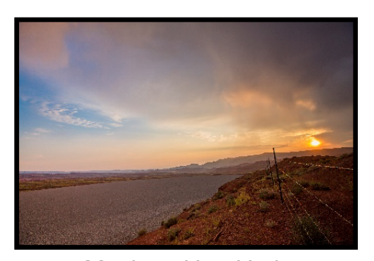
Mexican Hat, Utah