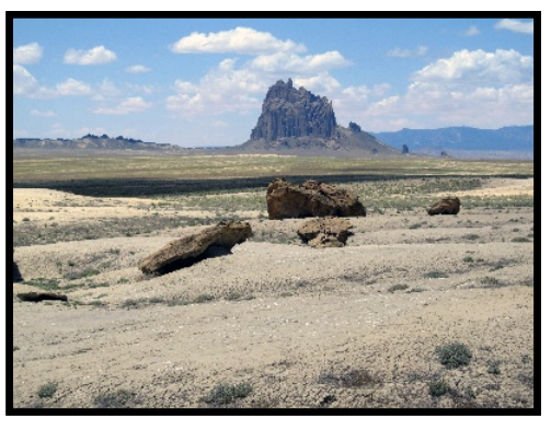
Shiprock, New Mexico