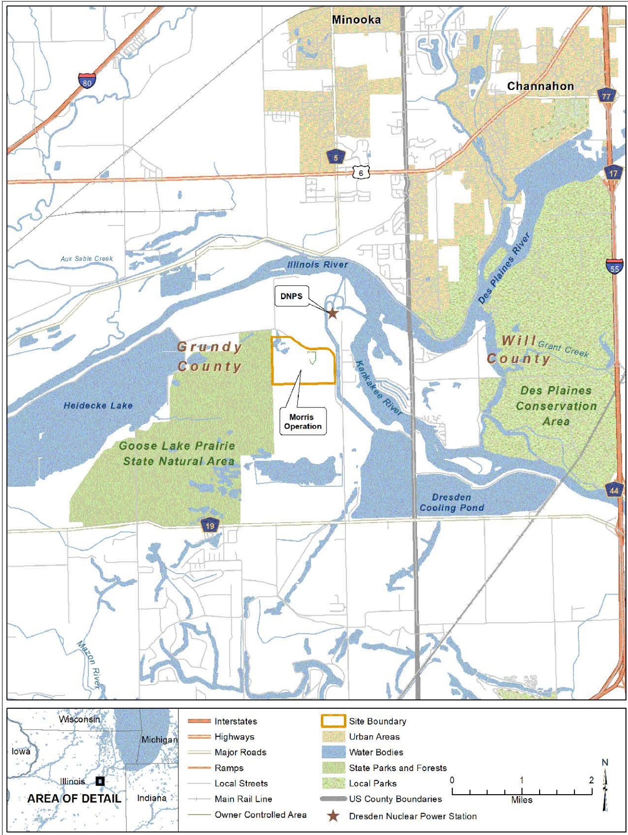
Location of GEH-Morris Operation Independent Spent Fuel Storage Installation