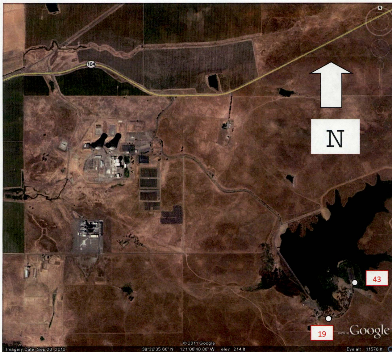
Figure B-2 Radiological Environmental Control Locations