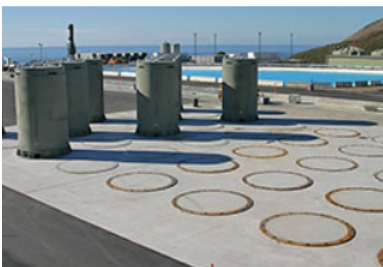
Spent fuel dry storage casks