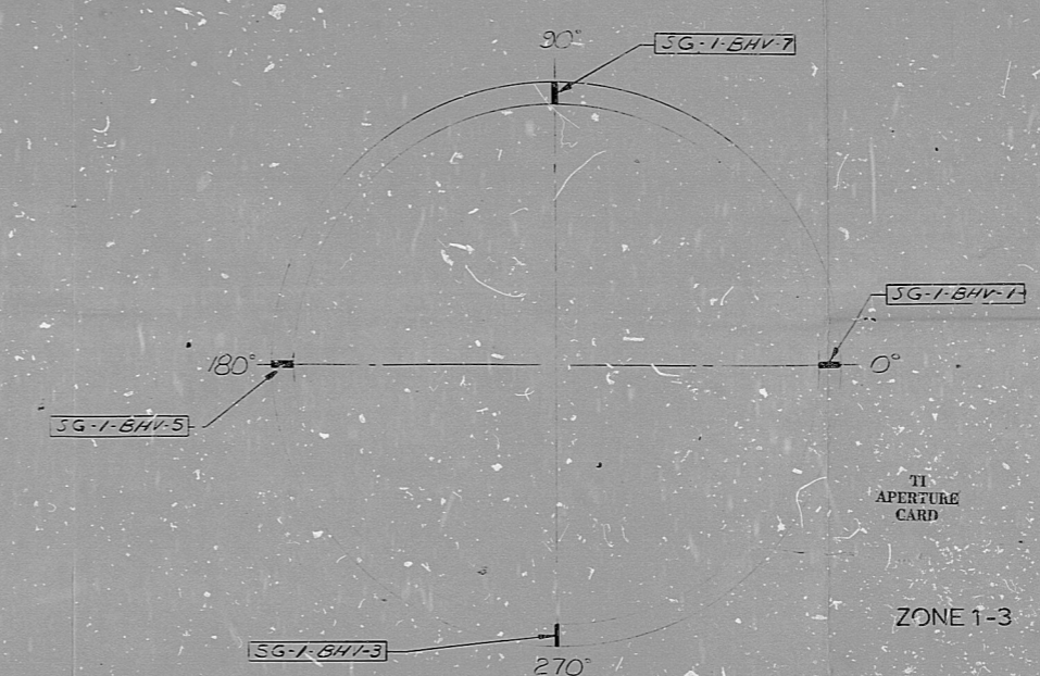
SECTION CC LOWER EXTENSION RING SCALE: NONE

*NOTE: THIS IS A CLASS 2 CATEGORY C-A WELD