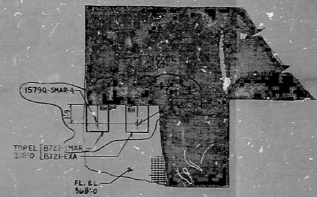
PART PLAN EL 365.0 (THIS DWG. FC)