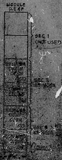
TALK UP DRAIN VALVE CROSS REFERENCE TABLE