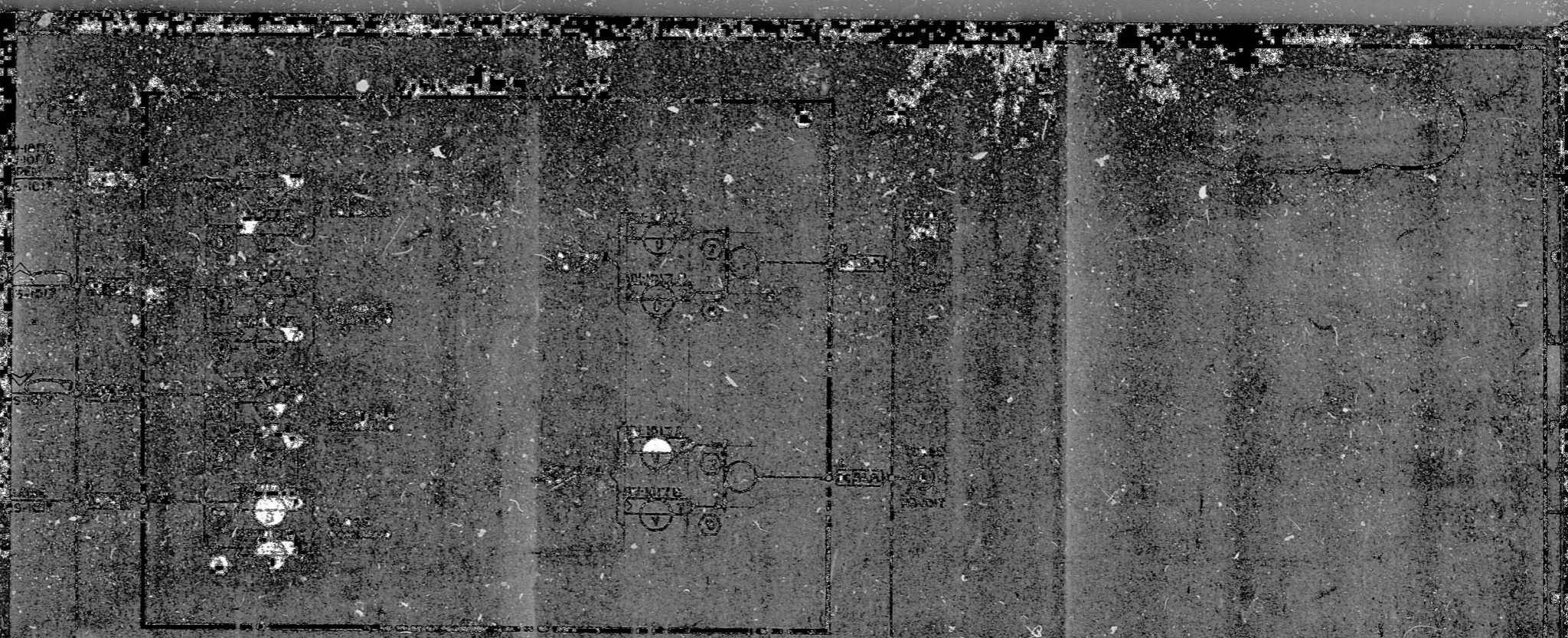
STEAM PIPE MOTOR OPERATED DRAIN VALVE CONTROL CIRCUIT