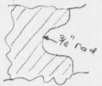
Enlarged view of scalloped cut