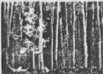
by Ansel Adams in This Is the American Earth