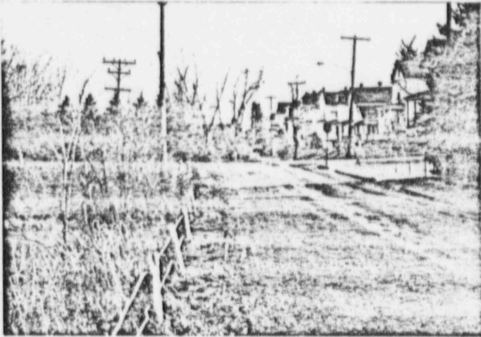
View of Lot and Road Barrier Looking South