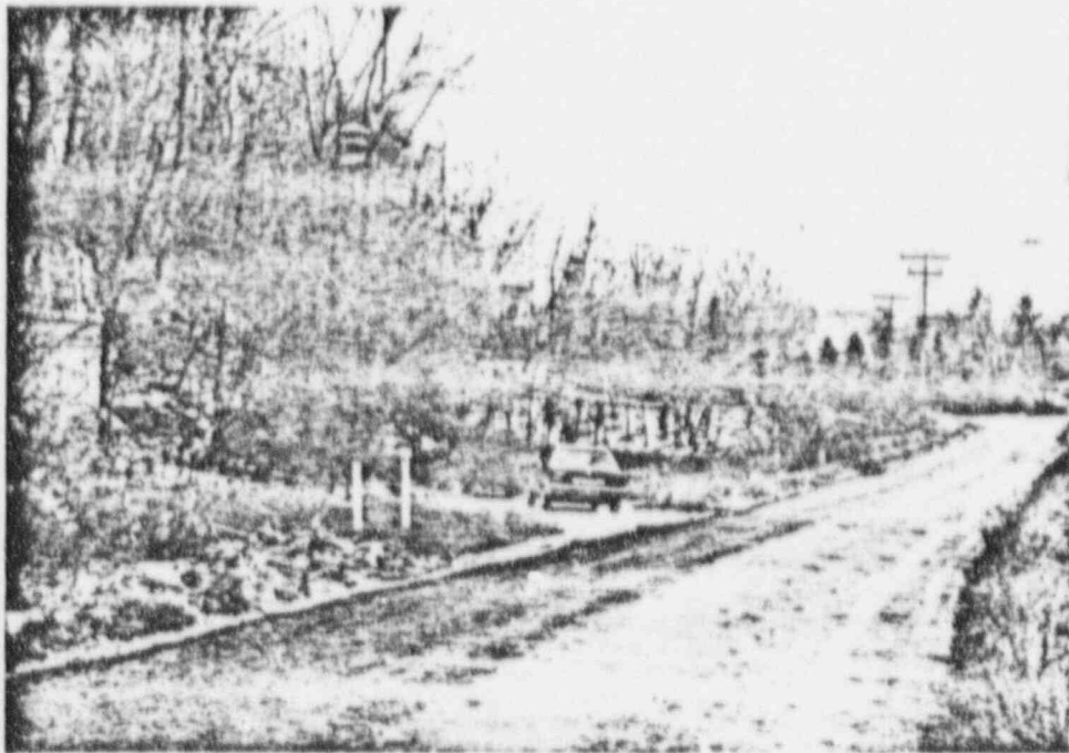
View of Property Looking North