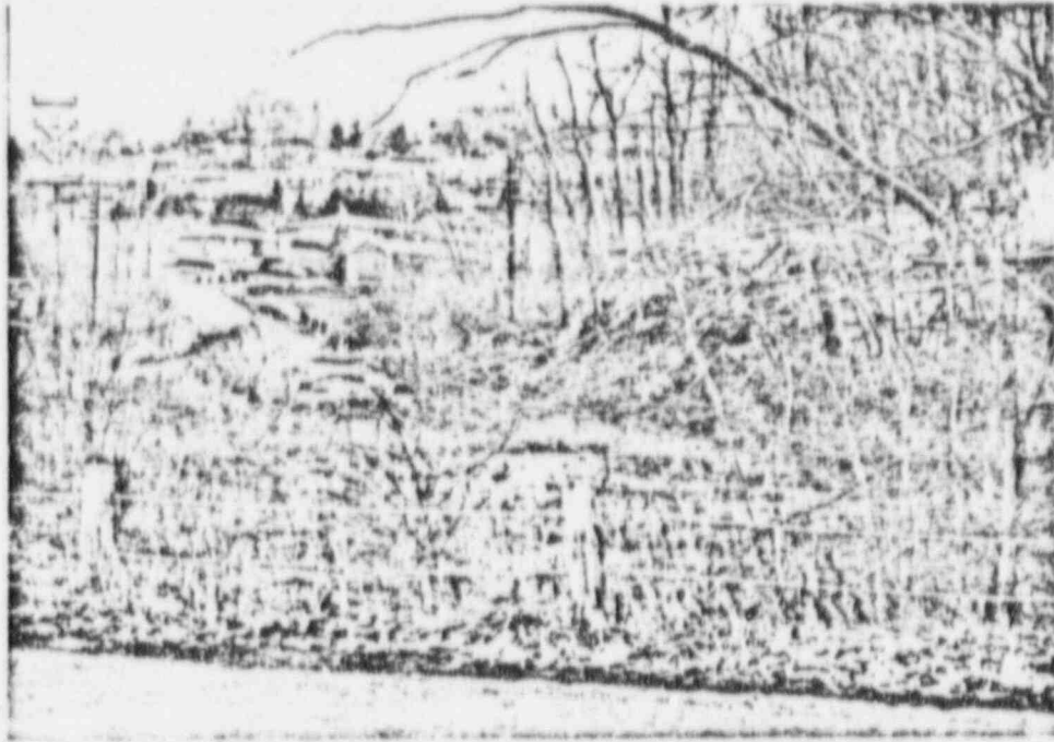
View of Property Looking South