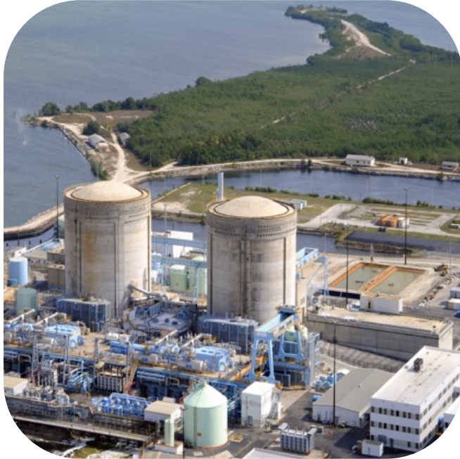
Turkey Point Units 3 & 4 (FL) Renewed License Issued December 2019