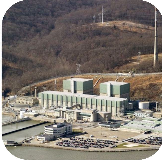
Peach Bottom Units 2 & 3 (PA) Renewed License Issued March 2020