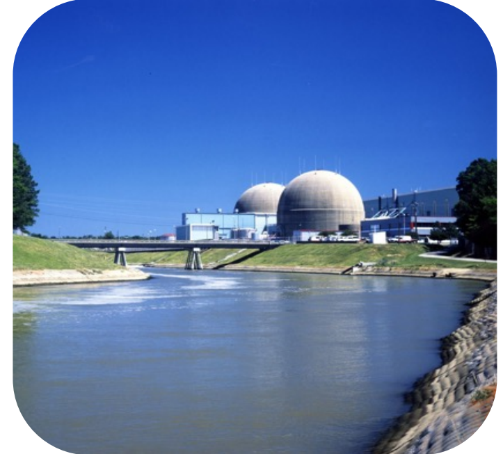
Surry Units 1 & 2 (VA) Current expiration 2032 & 2033 Under review