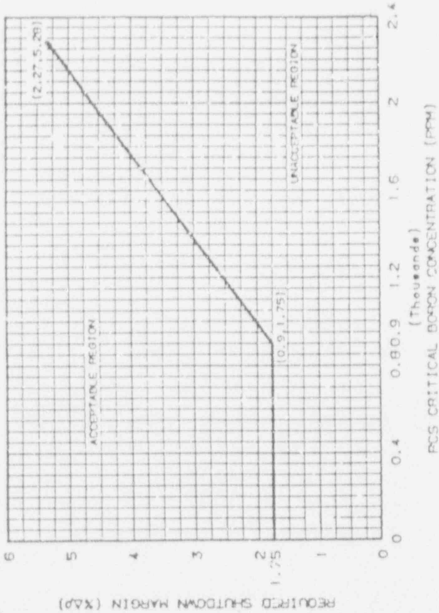
FIGURE 3.1-1 REQUIRED SHUTDOWN MARGIN VERSUS RCS CRITICAL BORON CONCENTRATION (MODES 1, 2, 3, AND 4)