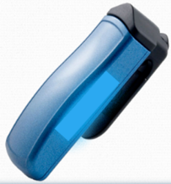
Example: Digital Personnel Dosimeter