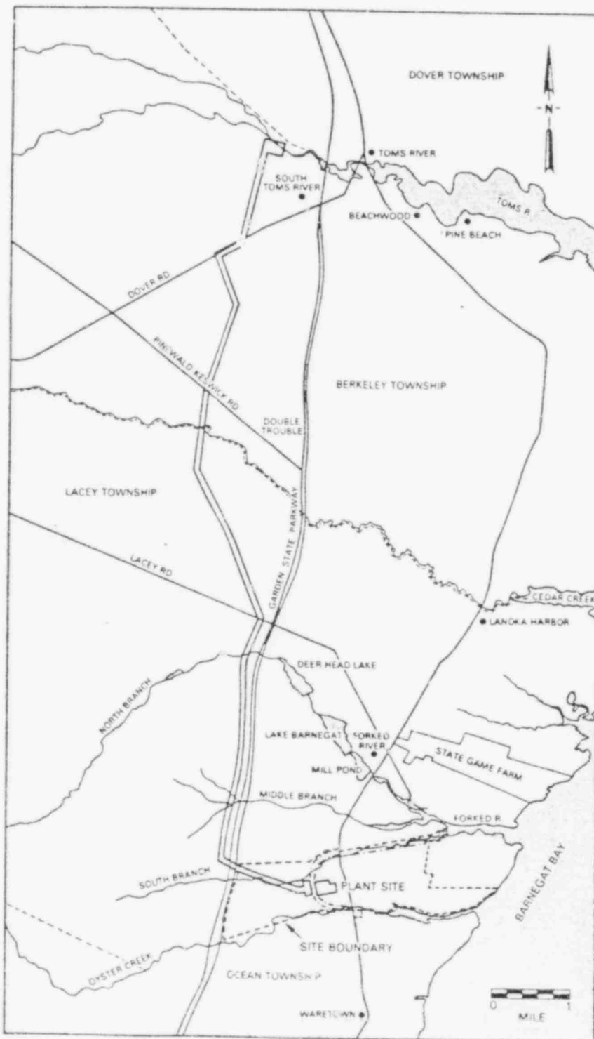
FIGURE 3.10 TRANSMISSION LINE ROUTING