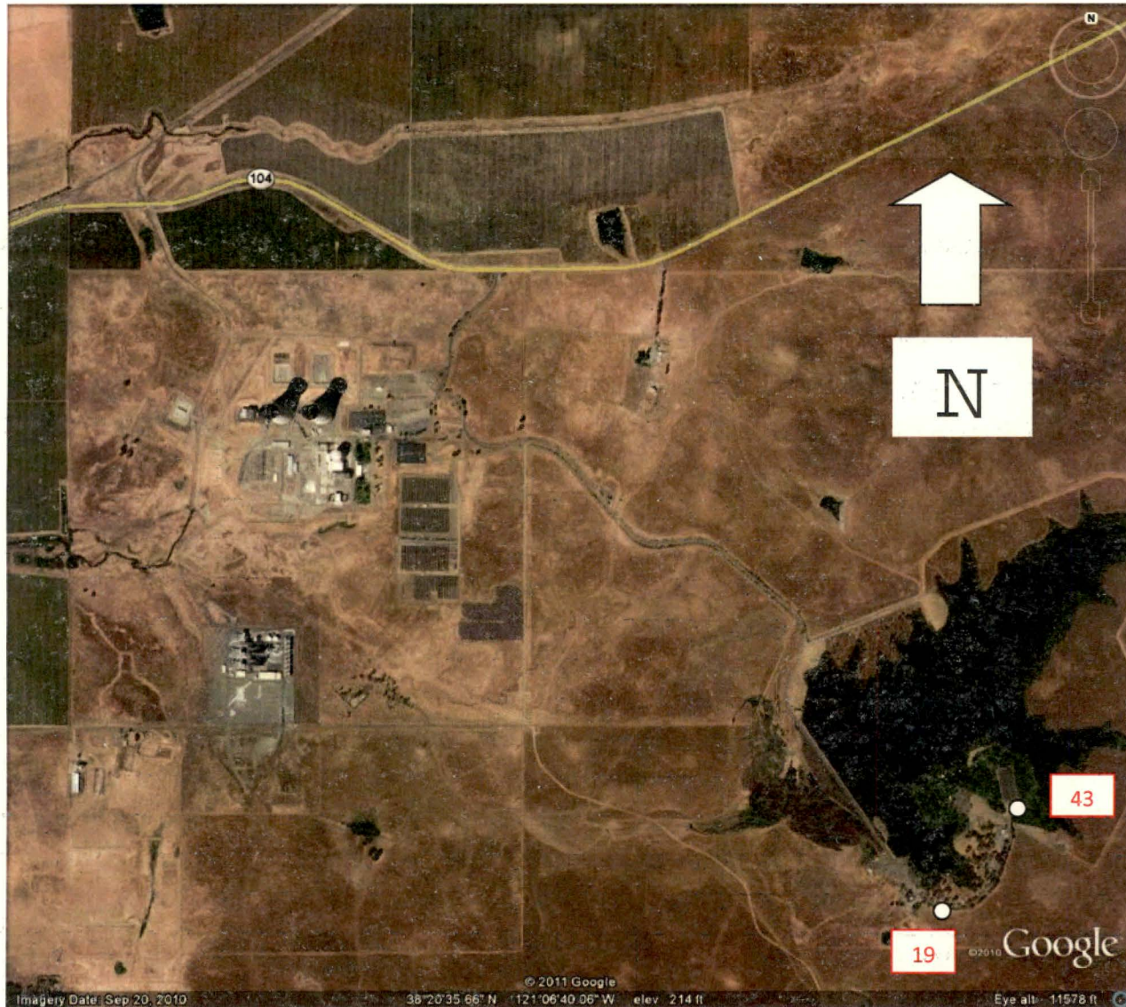
Figure B-2 Radiological Environmental Control Locations