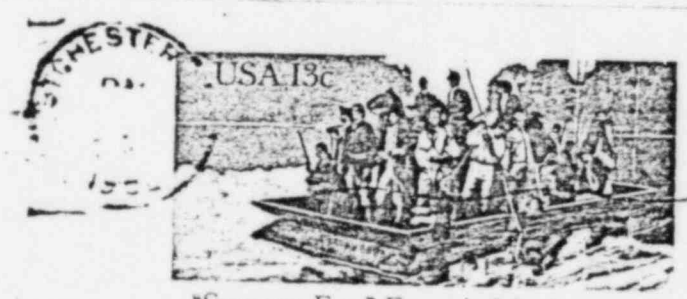
"Swamp Fox" Francis Marion, 1782