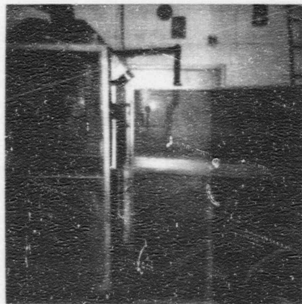
PHOTO B: Centrifuge motor (at bottom left) and centrifuge tank (at center behind sheet metal) in the centrifuge hood.