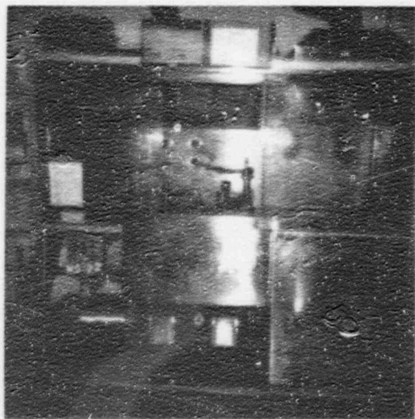
PHOTO A: Receptacle tank, pump and transfer lines (with sump tank at lower right) to centrifuge.