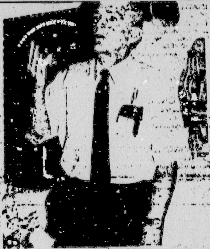
U.S. Senator Bennett Johnston

CHEROKEE NEWS, Haynesville, La., Thursday, September 13, 1939.