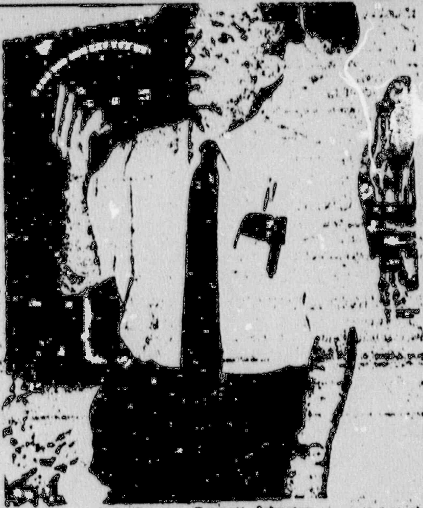
U.S. Senator Bennett Johnston

CLAYTONVILLE NEWS, Haynesville, La., Thursday, September 13, 1934.