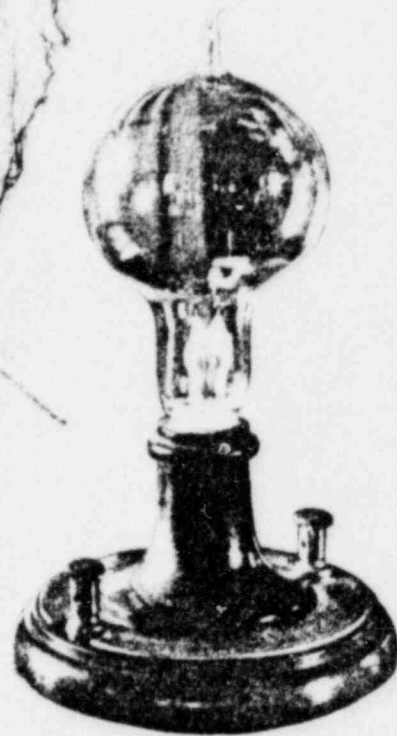
THOMAS ALVA EDISON

"He has led no armies into battle — he has conquered no countries — yet he wields a power the magnitude of which no warrior ever dreamed. . . This democratic, kindly, modest man has bestowed upon the human race blessings instead of bondage, service instead of serfdom, construction instead of conquest. . . He is humanity's friend."