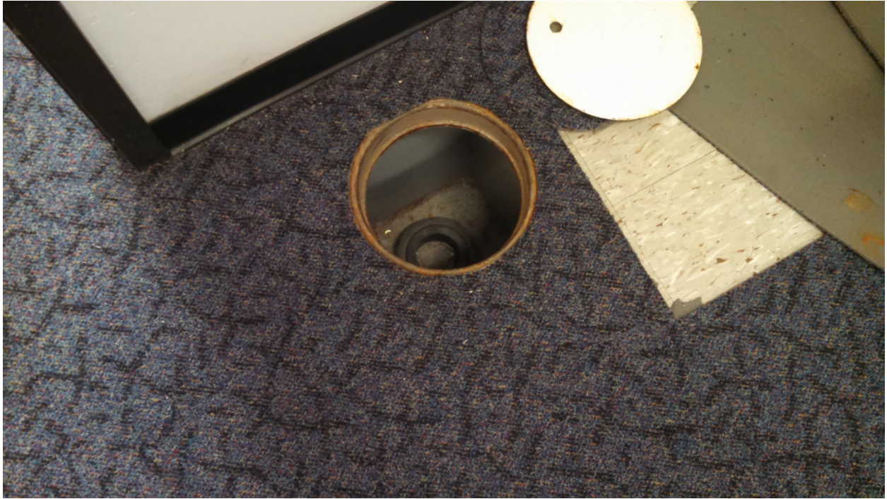
E-50 Source Vault