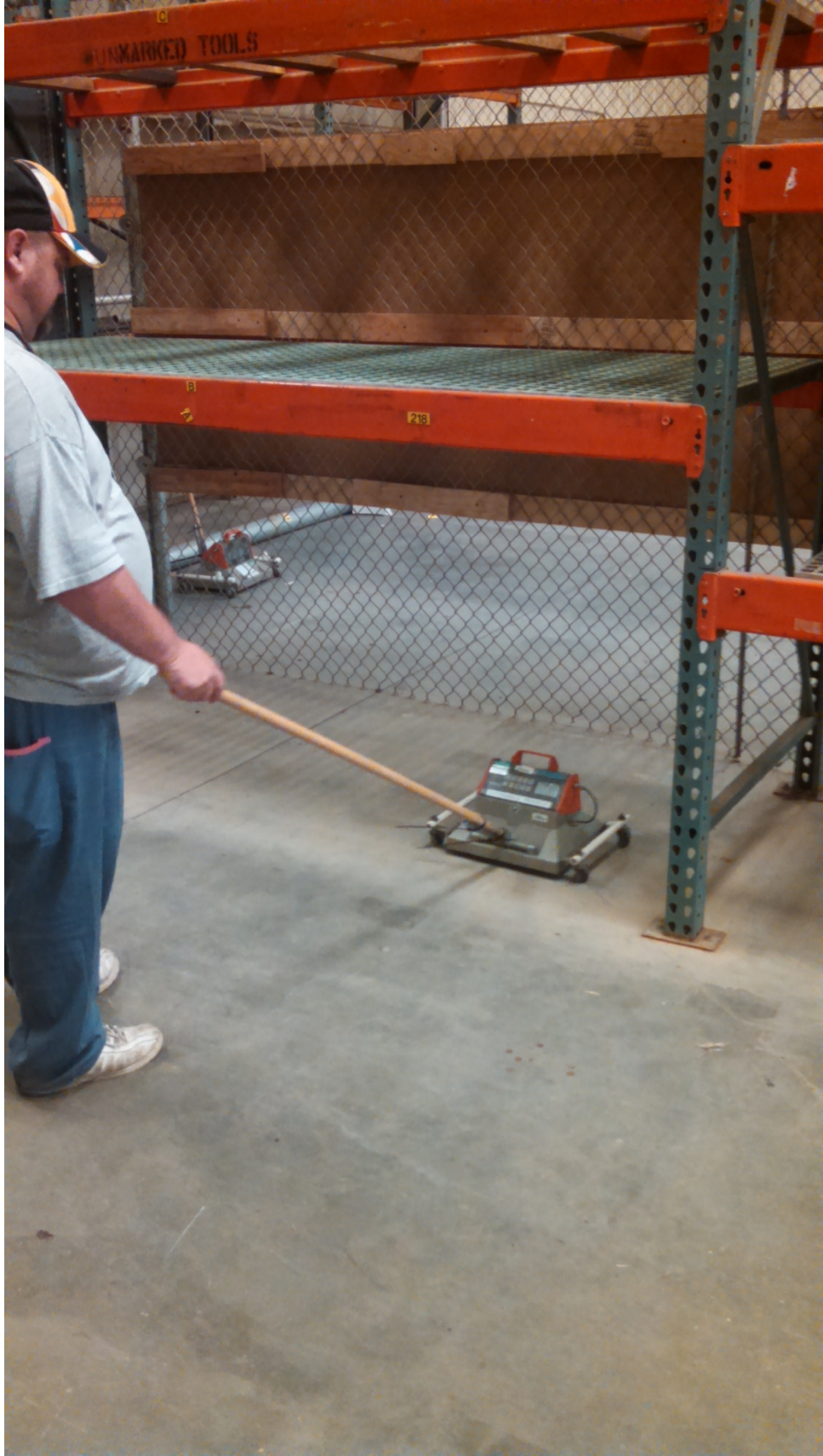
Bicon Floor Monitor