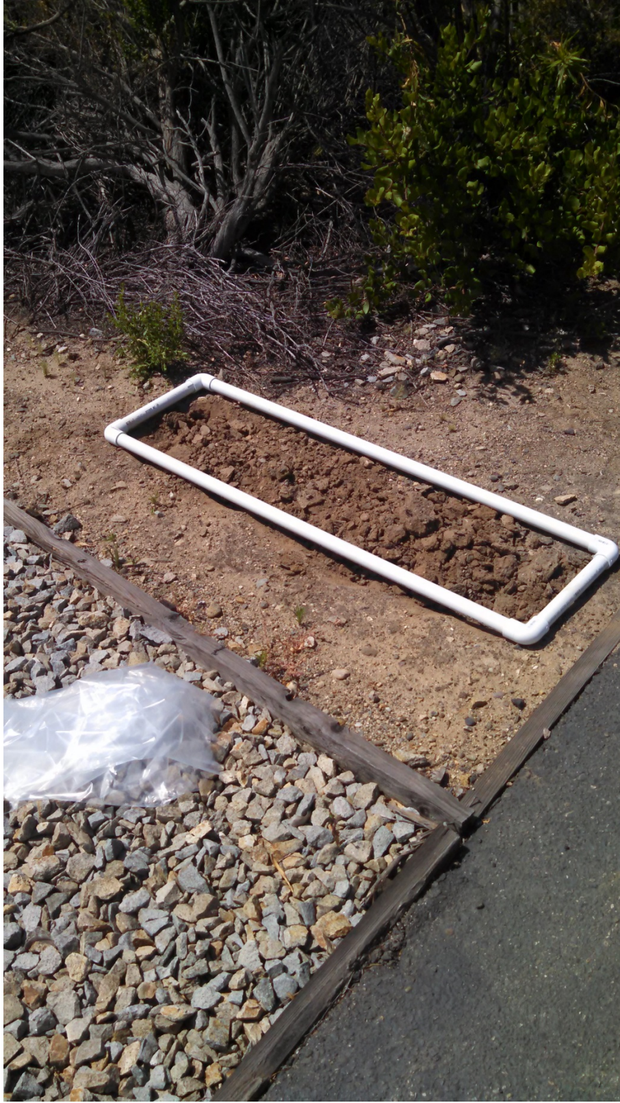
Soil Sampling Jig