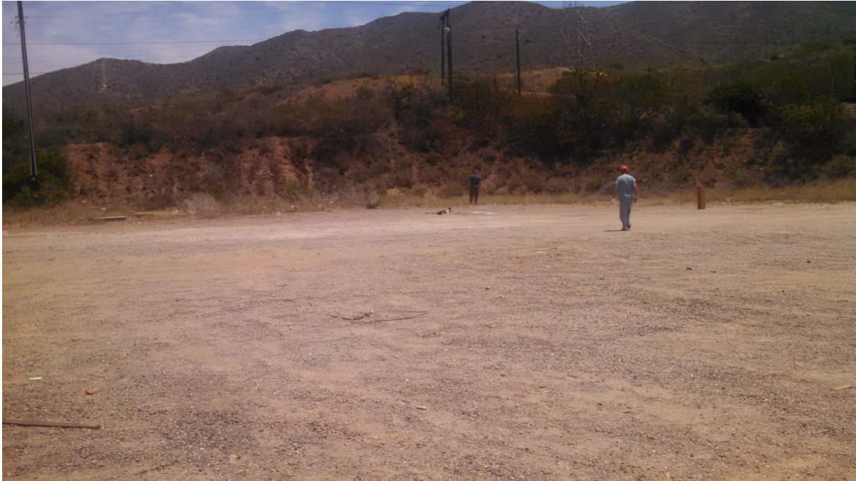
STAR Yard Cross-Hatched Area