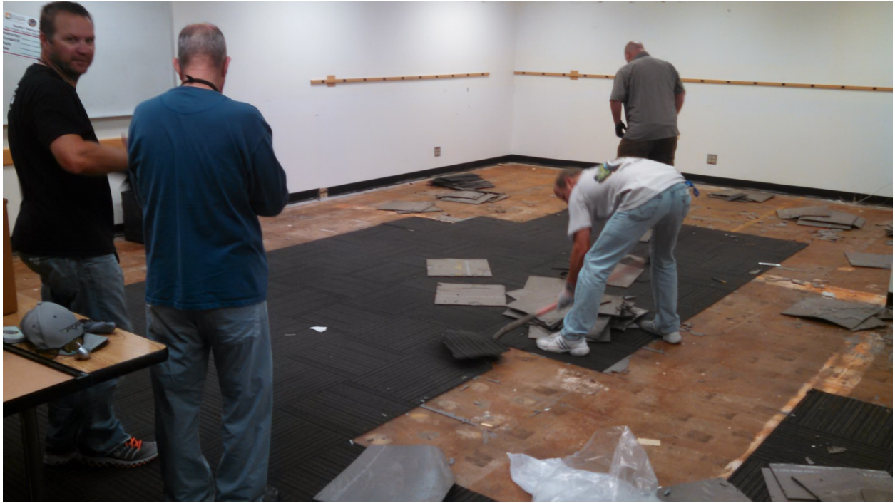
G-48 Rm 102 Carpet Removal