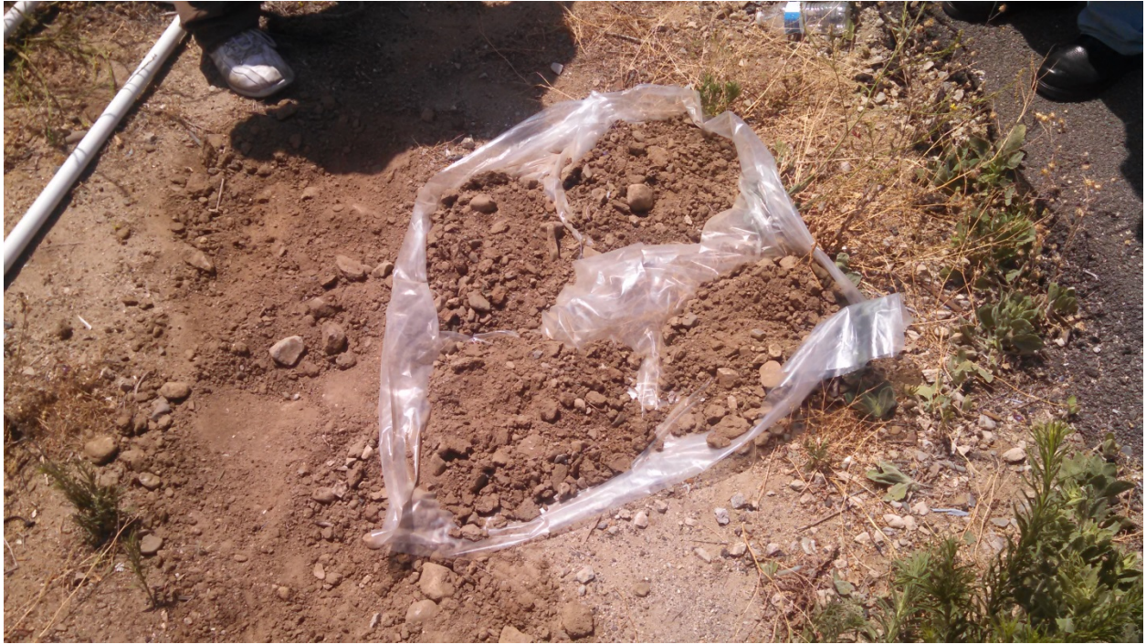
Soil Sample Mixing