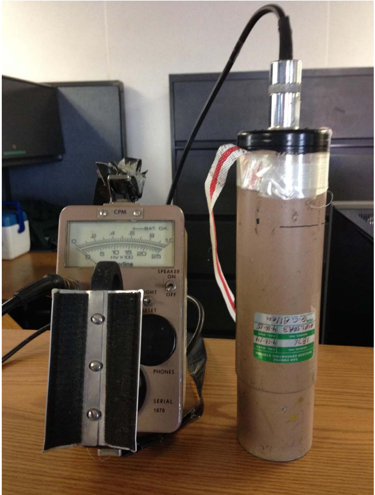
Eberline ASP-1 with SPA-3 Probe