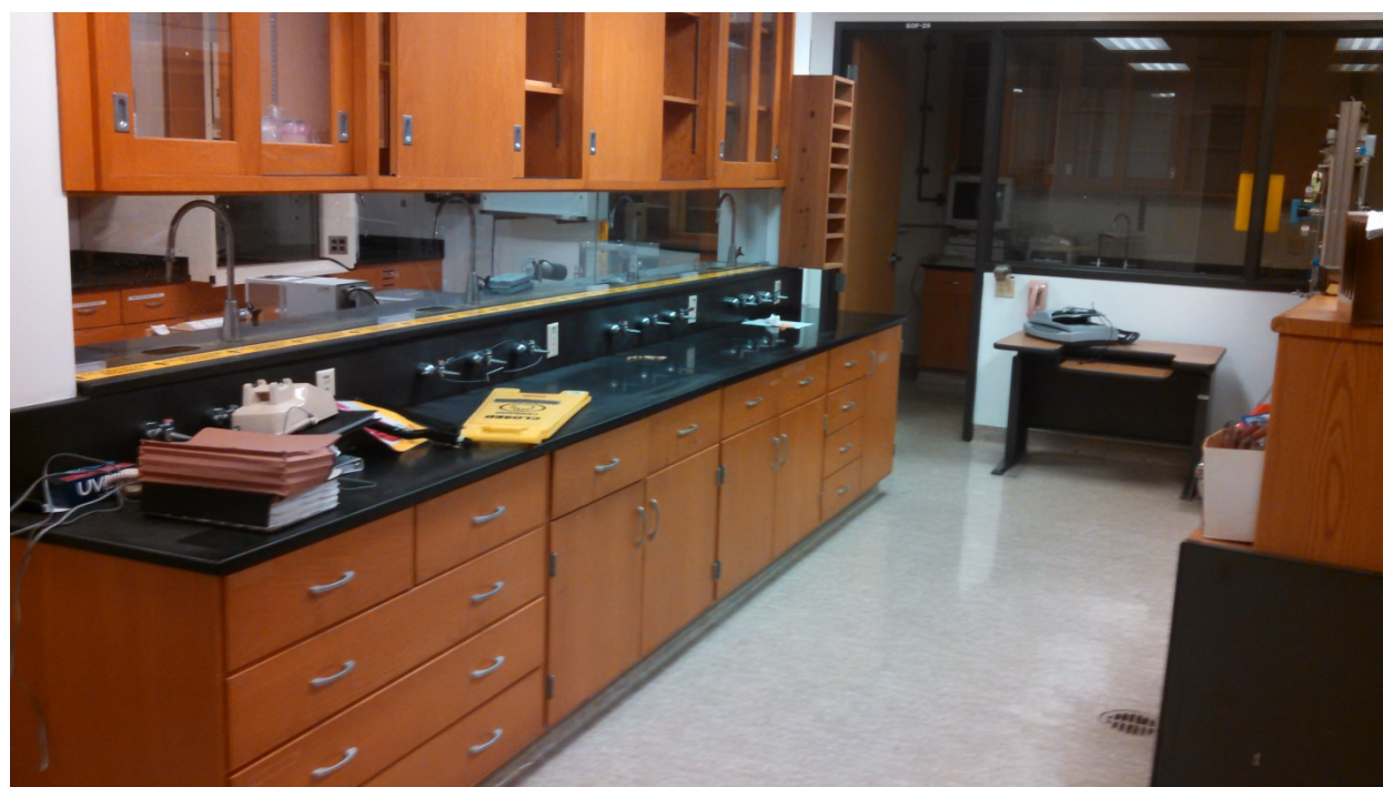
E-50 Chemistry Lab