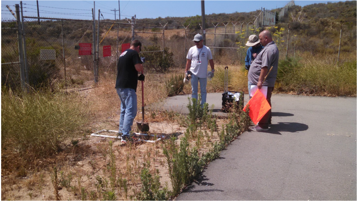
Reference Area 2