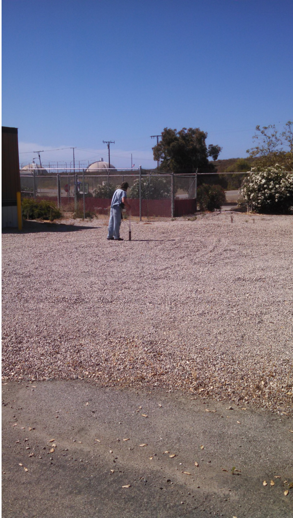
Surface Static Reading