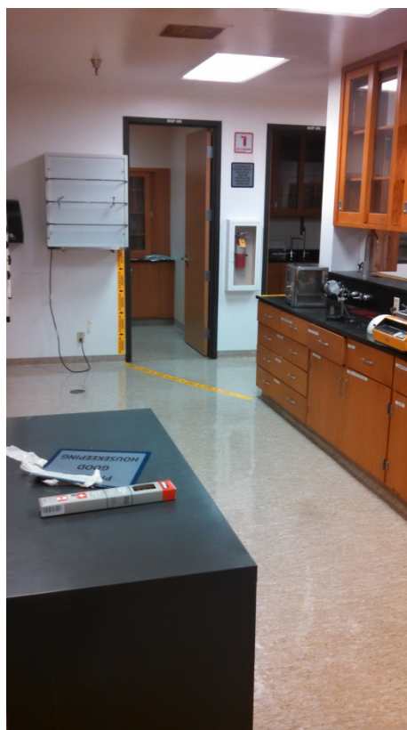
E-50 Chemistry Lab