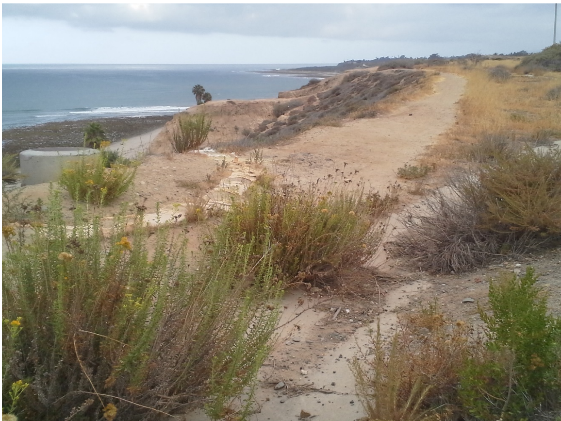
Reference Area 3