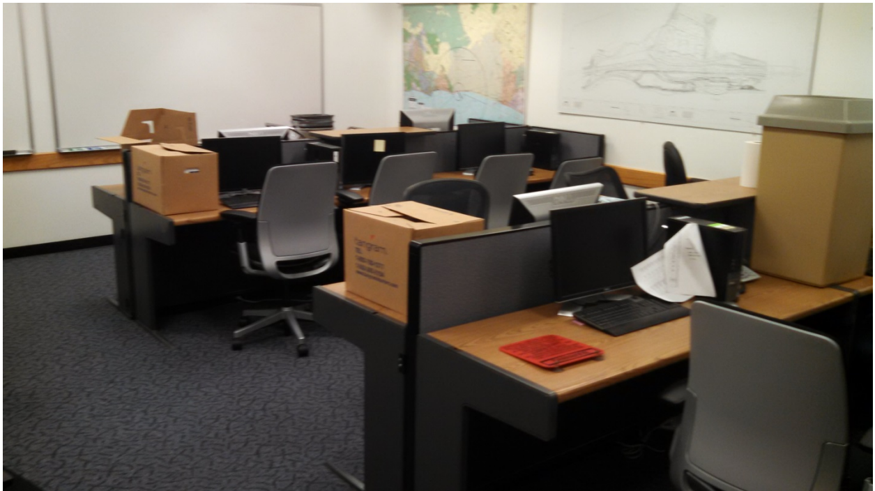
E-50 HP Classroom