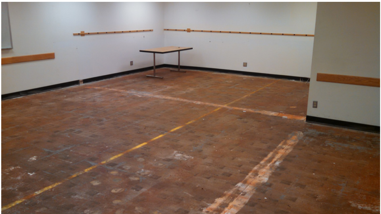
G-48 Rm 102