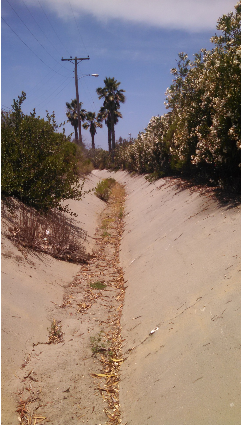
Storm Drainage Culvert