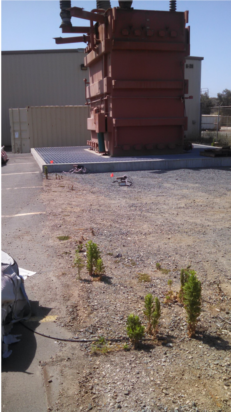
STAR Yard Increased Countrate Area