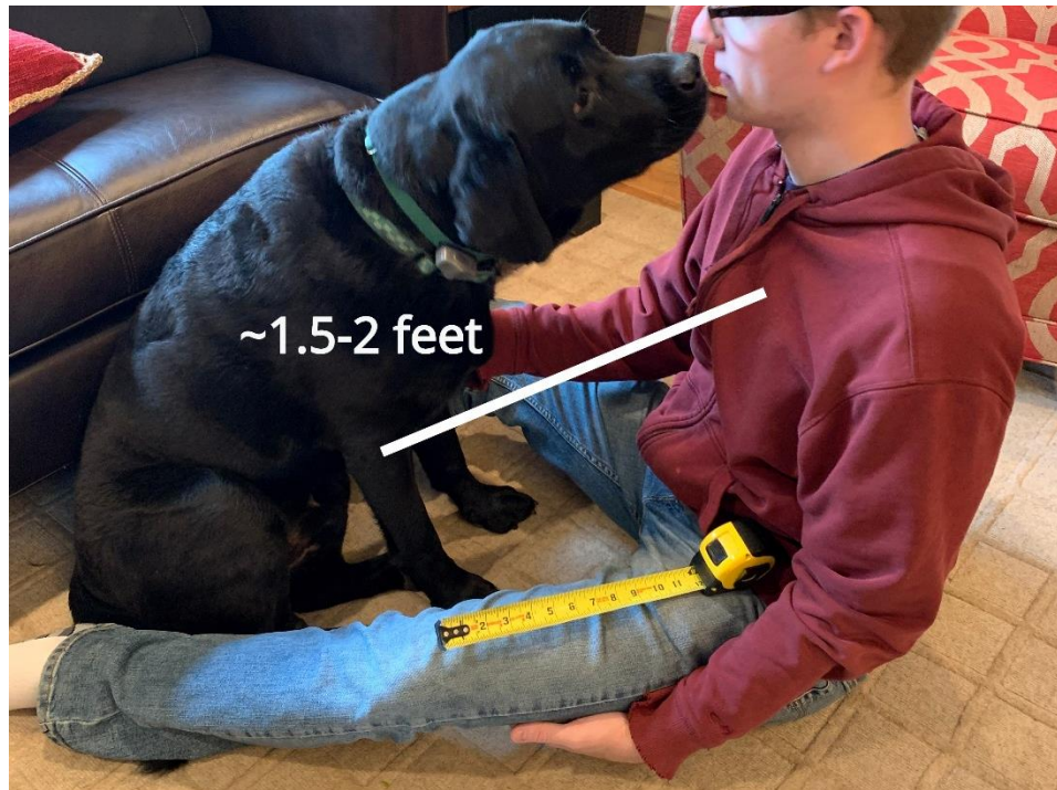
Figure 3. Dog petting.