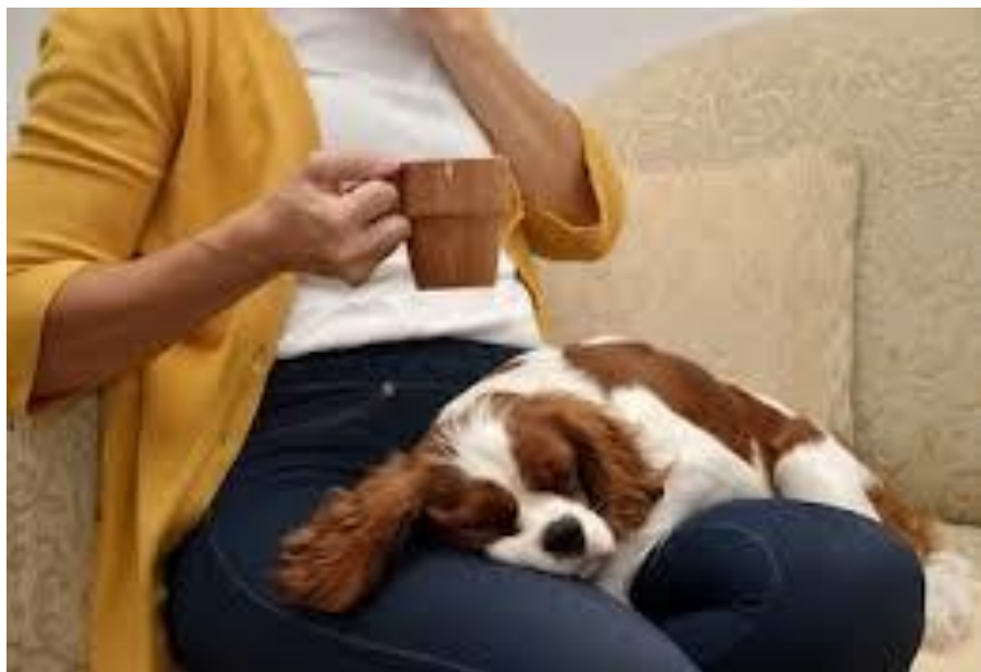
Figure 6. Dog in lap.

through the dog's torso to reach the person's torso, further reducing the net dose rate to the torso. Given these considerations, distances of 6 inches are not reasonable, and therefore radiation dose rates at 6 inches are not a consideration for lap-sitting.