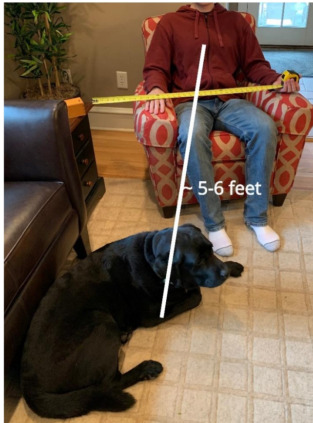
Figure 5. Dog near feet.