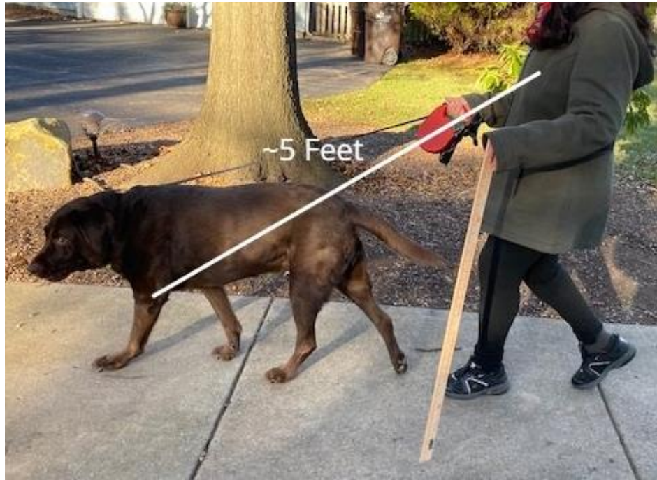
Figure 1. Large dog being walked by small adult.

Westgarth's results indicate only 19 % of large dogs are walked 3 or more times per day and that the average walk duration is 16 minutes to one hour long, with smaller dogs less likely to be walked 3 or more times per day and younger dogs more likely to be walked longer. This is another activity where an osteoarthritic dog is much less likely to participate, leading to less and shorter walks for such a dog. Therefore, on-leash dog walking is assumed to be performed twice a day for no more than 30 minutes each time, or one hour per day as a reasonably conservative estimate.