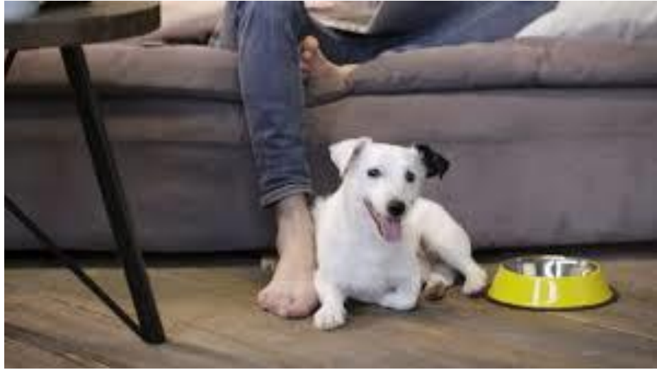
Figure 4. Dog at feet.

to the midpoint of a seated person's torso is a reasonable estimate. Figures 4 and 5 show typical positions.