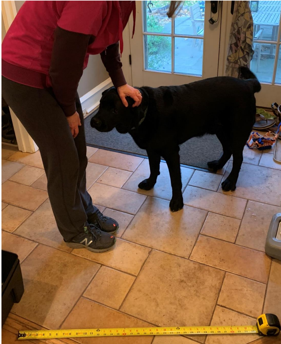
Figure 2. Dog petting.

While petting can be a frequent activity with dogs, each petting session typically does not last very long. Discussions with a focus group of dog owners indicated that a typical petting session would last 15-20 seconds and focus primarily on the dog's head. On a day with a lot of petting, there might be 8 to 10 such petting sessions, with fewer on other days, such as when at work or if the dog is outside often. This indicates petting commonly occupies up to 200 seconds, or 3.33 minutes per day. To be conservative, this is rounded to 5 minutes. Additionally, most petting, being petting on the head, would result in a human torso-dog joint distance of more than a foot, but less than 3 feet. While 2 feet is a reasonable estimate for the typical distance, it is conservatively assumed that the distance might be as little as 1 foot.