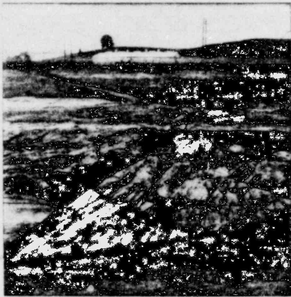
SPRAY POND #1 - FAULT ZONE 20 VIEW SOUTH