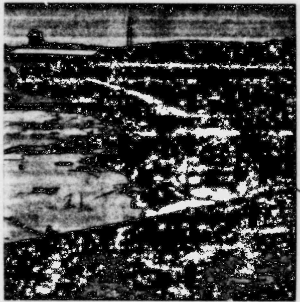
SPRAY POND #1 FAULTS 21 and 22 view south