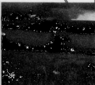
Dairy products, flower bulbs, and more are produced in every part of the state. In the foreground are some of the nation's finest orchards on the rich volcanic soil of Oregon's Willamette Valley.