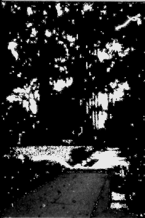
Oregon is known for its diversity with spectacular parks even in downtown areas. In the background is the headquarters for the First National Bank of Oregon.