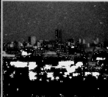
Port of Portland, a leading West Coast shipping center, is home for the largest dry dock on the West Coast.