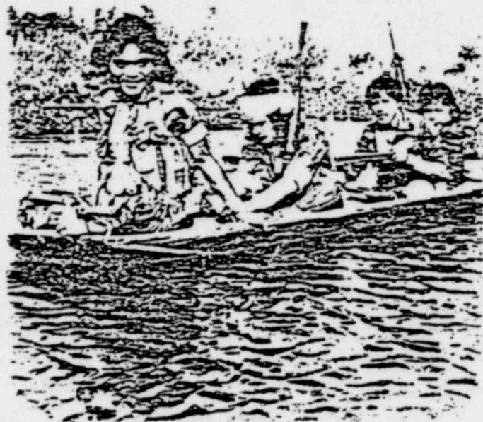
A platoon of Moro National Liberation Front guerrillas travels through a rice paddy in a banca , or dugout canoe.

Later in the afternoon, other members of the guerrilla squad joined us. I spent the rest of the day conducting interviews, holding photo sessions and moving from house to house to keep ahead of the government troops. Thanks to