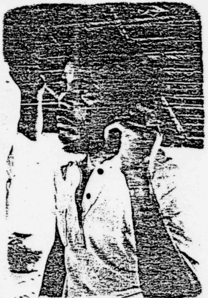
A Moro National Liberation Front field commander.

Later, I contacted a priest who was conducting an investi-