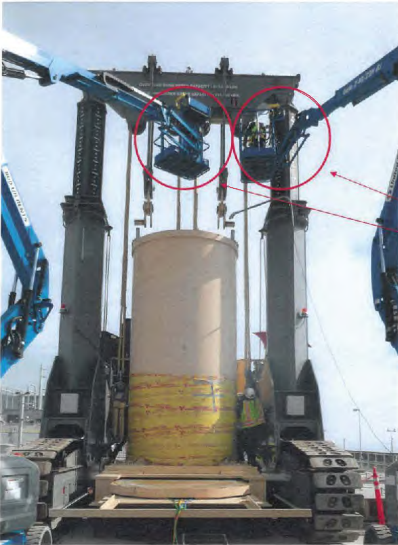
Rigger-in-Charge & 2 nd Qualified Rigger