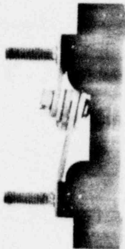
Side View of States Company Terminal Block in Assembled Position