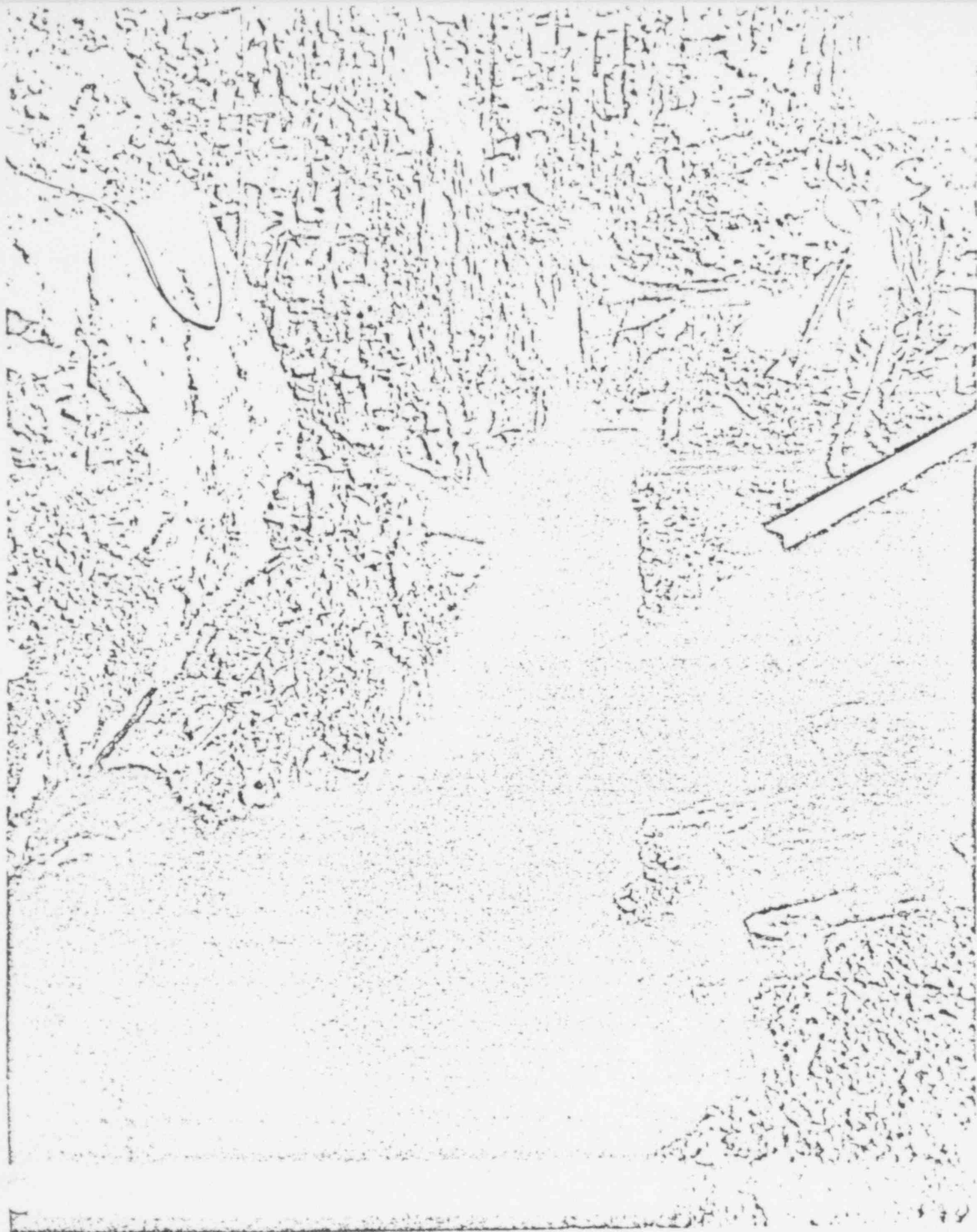
PHOTO 13. - Fracture Zone A at Rh and N Lines Looking northeast at zone after being filled with dental concrete.