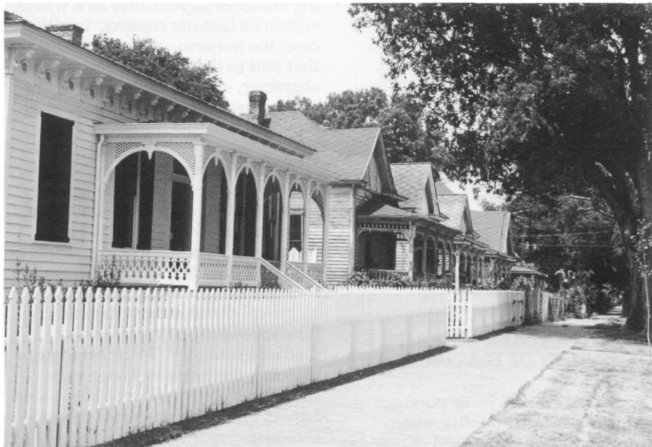
Ordeman-Shaw Historic District, Montgomery, Montgomery County, Alabama. Historic districts derive their identity from the interrelationship of their resources. Part of the defining characteristics of this 19th century residential district in Montgomery, Alabama, is found in the rhythmic pattern of the rows of decorative porches. (Frank L. Thiermonge, III)

business districts canal systems groups of habitation sites college campuses estates and farms with large acreage/ numerous properties industrial complexes irrigation systems residential areas rural villages transportation networks rural historic districts