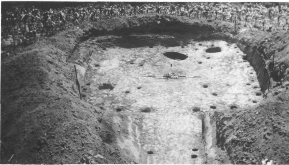
Criterion D - Champe-Fremont 1 Archeological Site, Omaha vicinity, Douglas County, Nebraska. This archeological site, dating from ca. 1100-1450 A.D., consists of pit houses and storage pits which have the potential to yield important information concerning the subsistence patterns, religious and mortuary practices, and social organization of the prehistoric residents of eastern Nebraska.