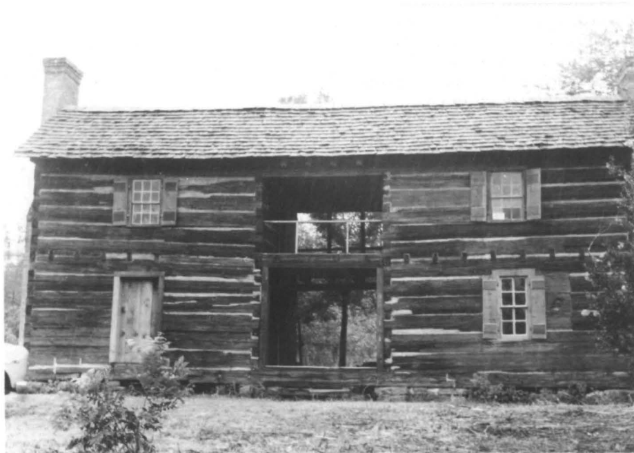
Looney House , Asheville vicinity, St. Clair County, Alabama. Examples of vernacular styles of architecture can qualify under Criterion C. Built ca. 1818, the Looney House is significant as possibly the State's oldest extant two-story dogtrot type of dwelling. The defining open center passage of the dogtrot was a regional building response to the southern climate. (Photo by Carolyn Scott).