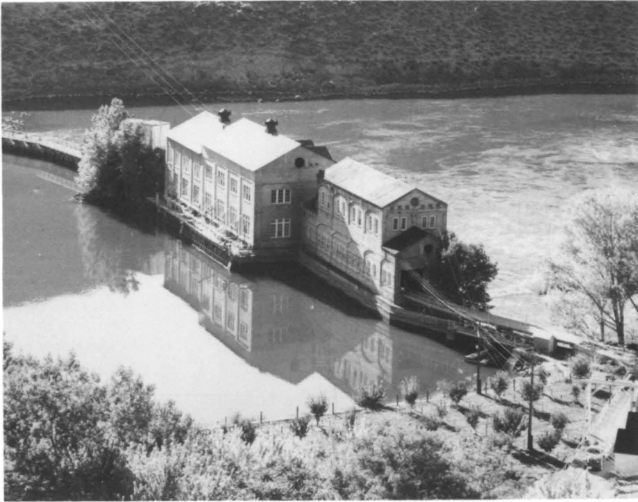
Swan Falls Dam and Power Plant, Murphy vicinity, Ada County, Idaho. Significant works of engineering can qualify under Criterion C. Built between 1900-1907 the Swan Falls Dam and Power Plant across the Snake River is one of the early hydroelectric plants in the State of Idaho.