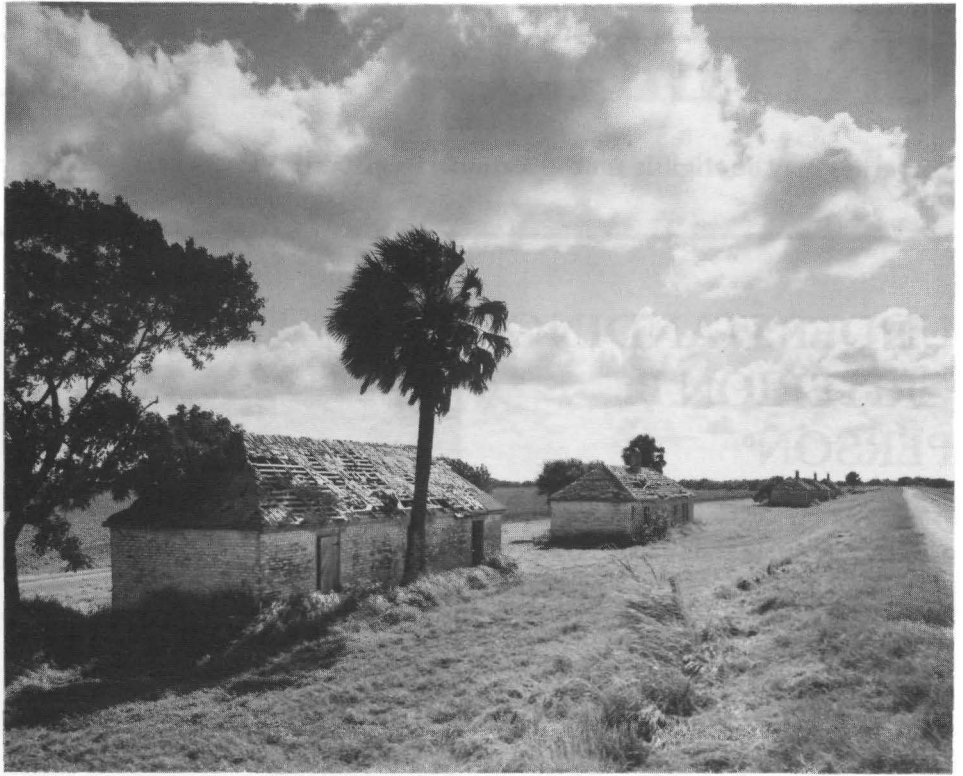
Criterion A - The Old Brulay Plantation, Brownsville vicinity, Cameron county, Texas. Historically significant for its association with the development of agriculture in southeast Texas, this complex of 10 brick buildings was constructed by George N. Brulay, a French immigrant who introduced commercial sugar production and irrigation to the Rio Grande Valley.