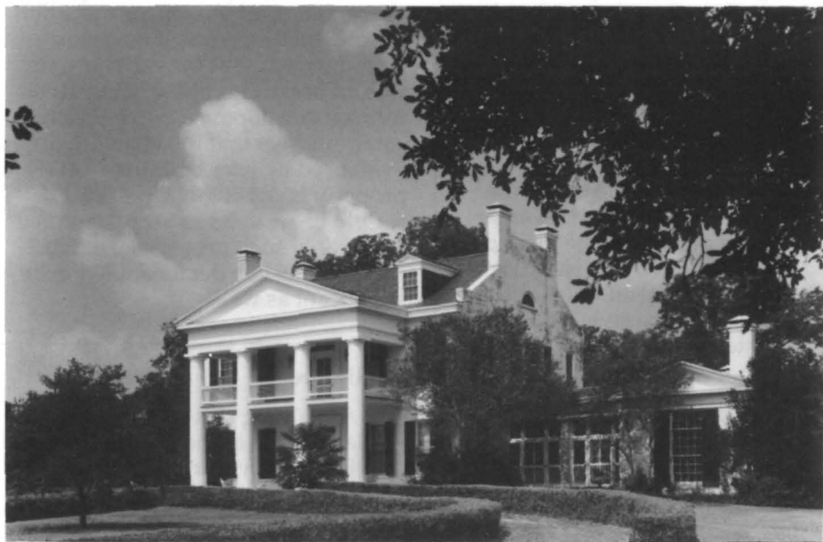
Richland Plantation, East Feliciana Parish, Louisiana. Properties can qualify under Criterion C as examples of high style architecture. Built in the 1830s, Richland is a fine example of a Federal style residence with a Greek Revival style portico. (Photo by Dave Gleason).

Properties may be eligible for the National Register if they embody the distinctive characteristics of a type, period, or method of construction, or that represent the work of a master, or that possess high artistic values, or that represent a significant and distinguishable entity whose components may lack individual distinction.