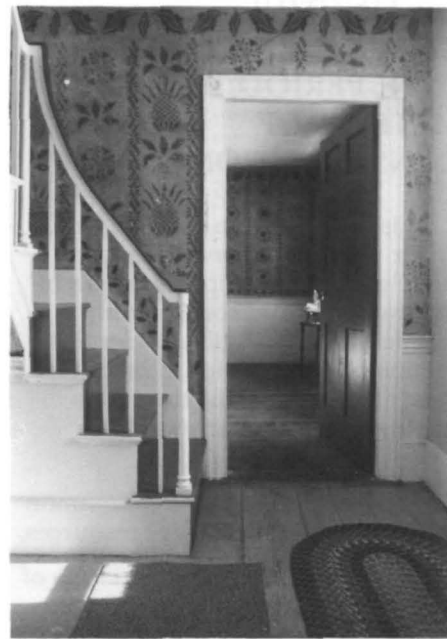
Grant Family House, Saco vicinity, York County, Maine. Properties possessing high artistic value meet Criterion C through the expression of aesthetic ideals or preferences. The Grant Family House, a modest Federal style residence, is significant for its remarkably well-preserved stenciled wall decorative treatment in the entry hall and parlor. Painted by an unknown artist ca. 1825, this is a fine example of 19th century New England regional artistic expression.

defined within the context of Criterion C. Districts, however, can be considered for eligibility under all the Criteria, individually or in any combination, as is appropriate. For this reason, the full discussion of districts is contained in Part IV: How to Define Categories of Historic Properties . Throughout the bulletin, however, districts are mentioned within the context of a specific subject, such as an individual Criterion.