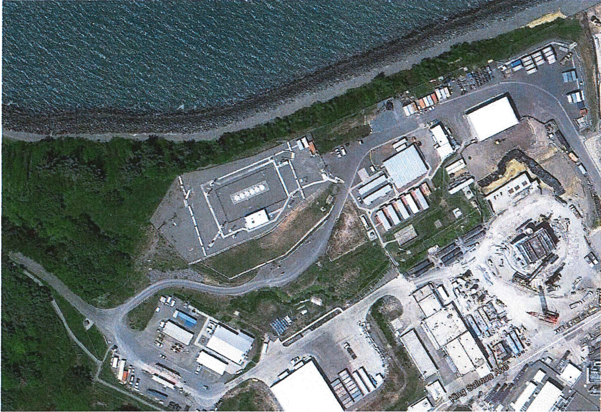
Figure 1 - Aerial view of HB ISFSI