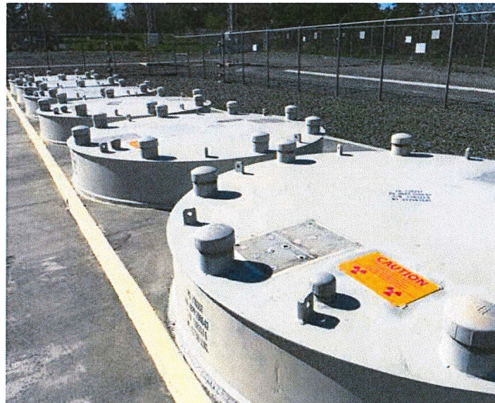
Figure 4 - Picture of HB ISFSI installed vault lids

HB ISFSI Security Boundary Fence monitoring was transferred to DCPD during third quarter of 2017 to facilitate HBPP Unit 3 decommissioning and 10 CFR 50 license termination. Env TLD stations T-2, T-3, T-4, T-5, T-23, and T-24 were added to this report beginning third quarter of 2017.