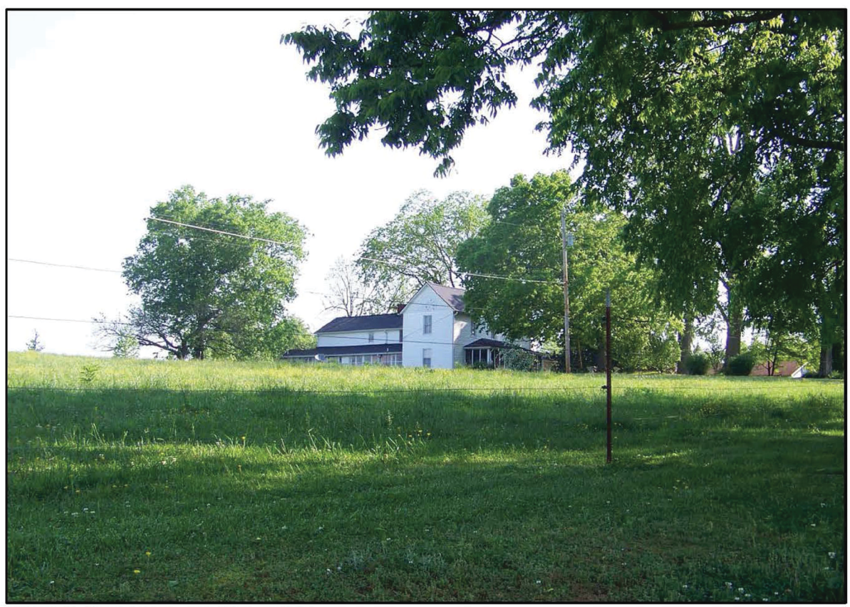
Figure 6. Structure 1, south elevation.