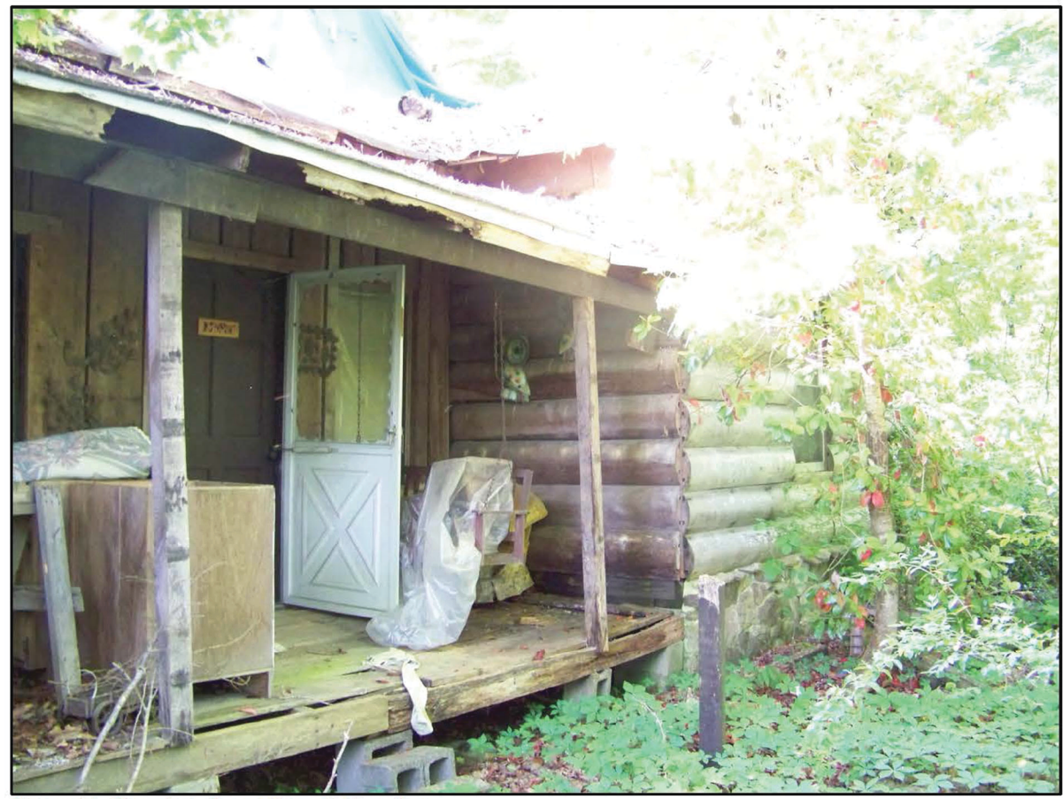
Figure 7. Structure 3, northwest elevation.