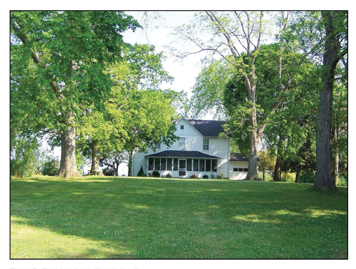
Figure 5. Structure 1, southeast elevation.